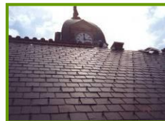
Slate or clay