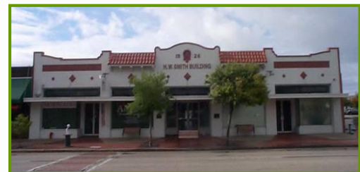
Allowed: Appropriate Materials