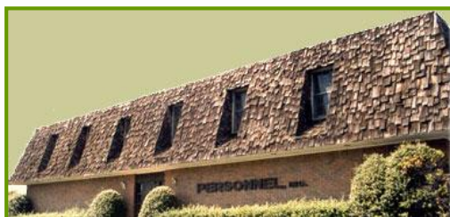
Not Allowed: Inappropriate Materials

Figure 8 shows the permitted roof materials. Other materials allowed include concrete tiles, asphalt fiberglass shingles, and metal standing seam. Cedar shake wood is allowed for residential uses only.