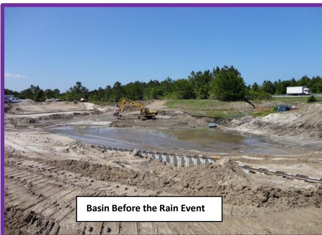
Basin Before the Rain Event