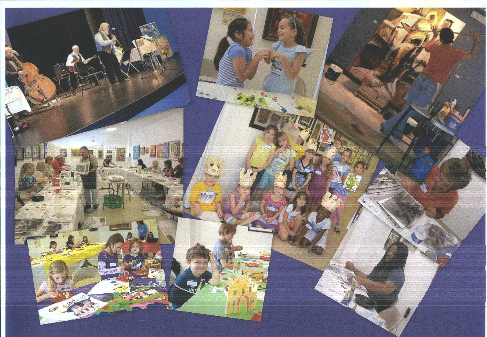
FCAL'S "Celebration of the Arts" March 14th to April 27th 2013