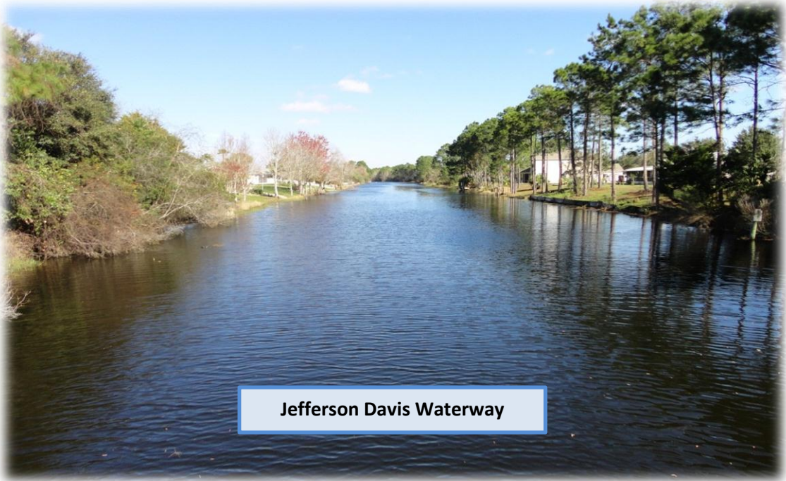
Jefferson Davis Waterway