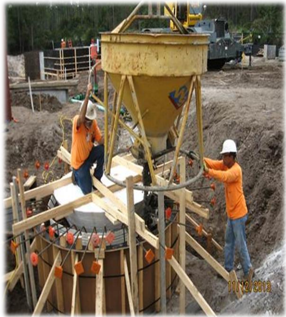
Poured center piers to clarifier #1 & #2