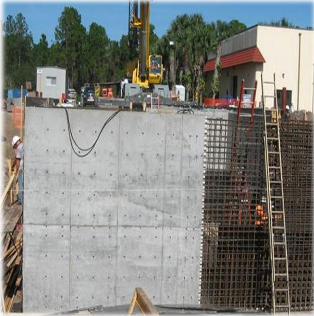
Walls of the EQ Tank