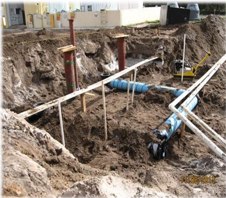
12" Backwash Pipe