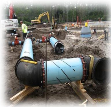
20” Permeate Main