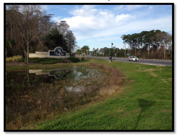
Before - Southwest Quadrant