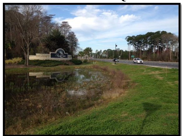
Before – Southwest Quadrant