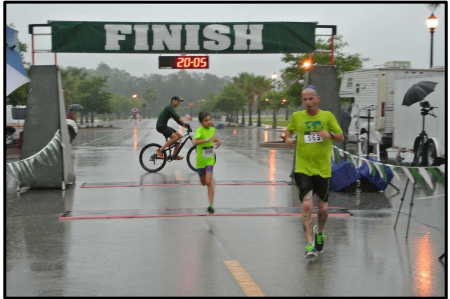
Arbor Day 5K and 1-Mile Flutter Fun Run