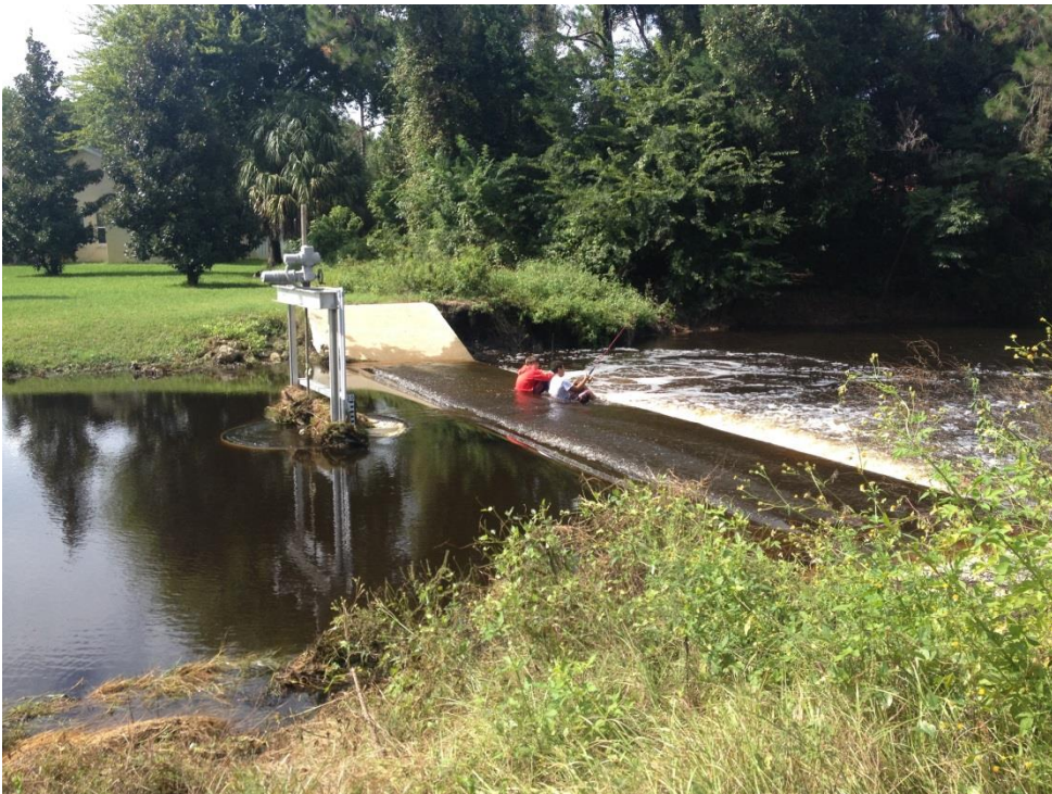
BA-1 on Saturday Note: Kids were asked to leave