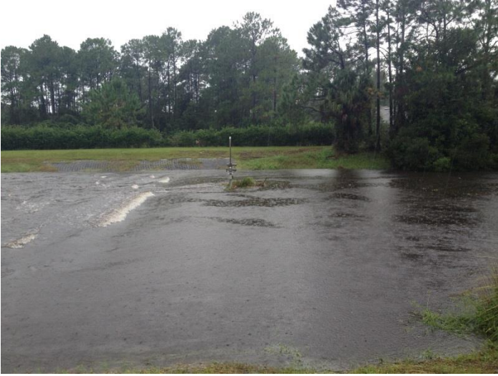
Friday – structure is covered completely with water