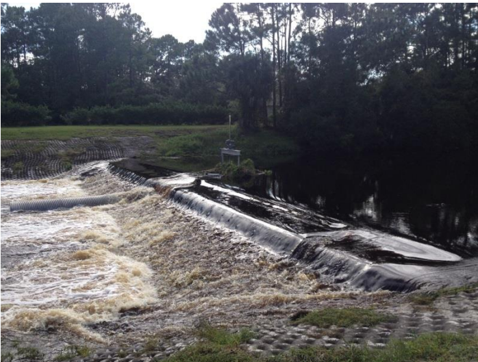
Saturday – water had gone down