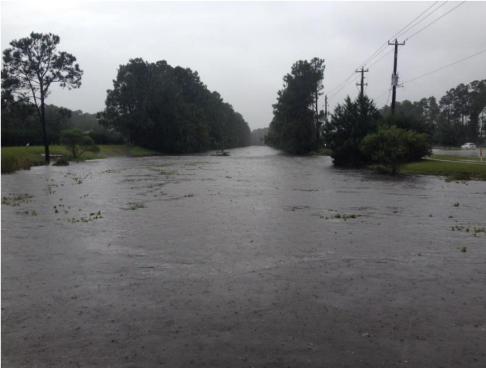
Friday Night – water went over the road at Pine Lakes Pkwy & Belle Terre Pkwy