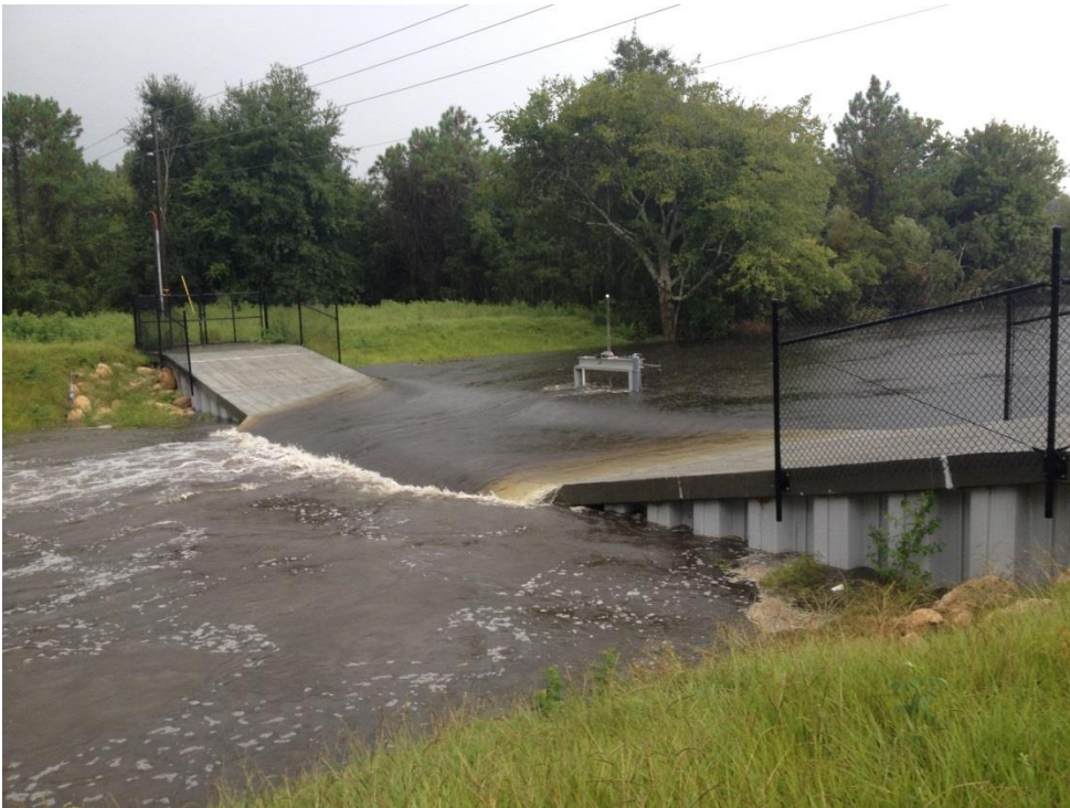
Structure M-3 on Friday