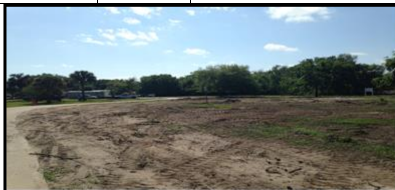
CLEARING WORK BEING DONE AT HOLLAND PARK