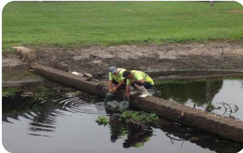
Sand bags temporarily dam weir structure to provide water for irrigation of Pine Lakes Golf Course.