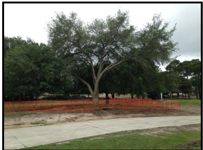
Tree Protection Barrier - Holland Park