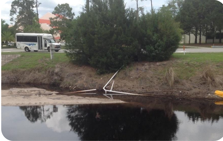
Pipe temporarily re-routed to provide water for landscape irrigation at Belle Terre Parkway.