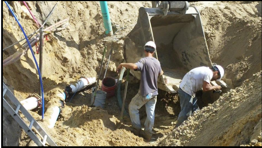
8" Water Main Tie In - Island Walk