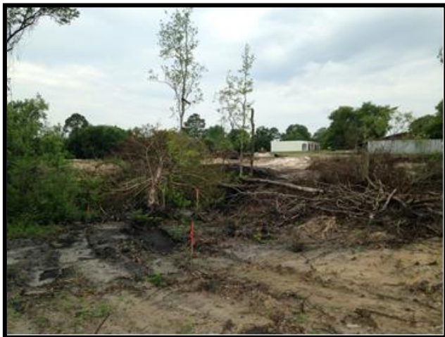
Clearing Work - Holland Park