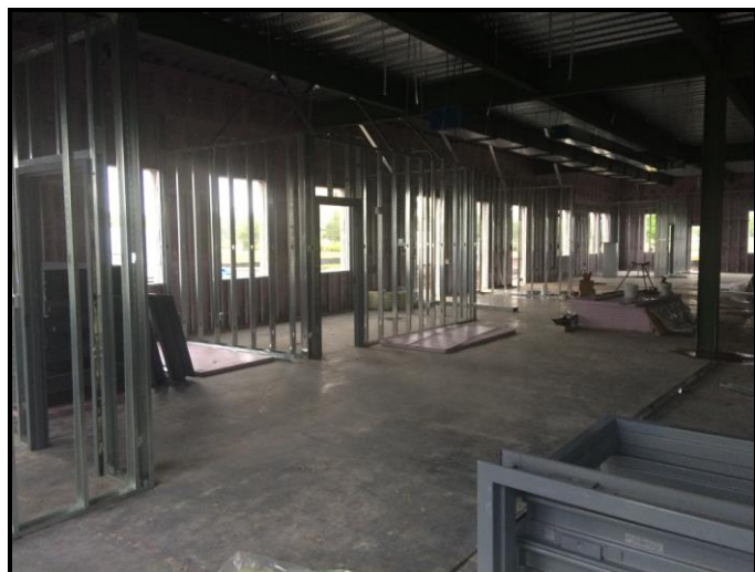
New City Hall Progress (2nd Floor)