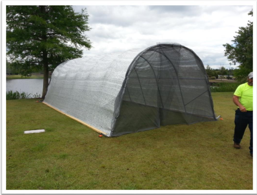
Arbor Day Butterfly Tent