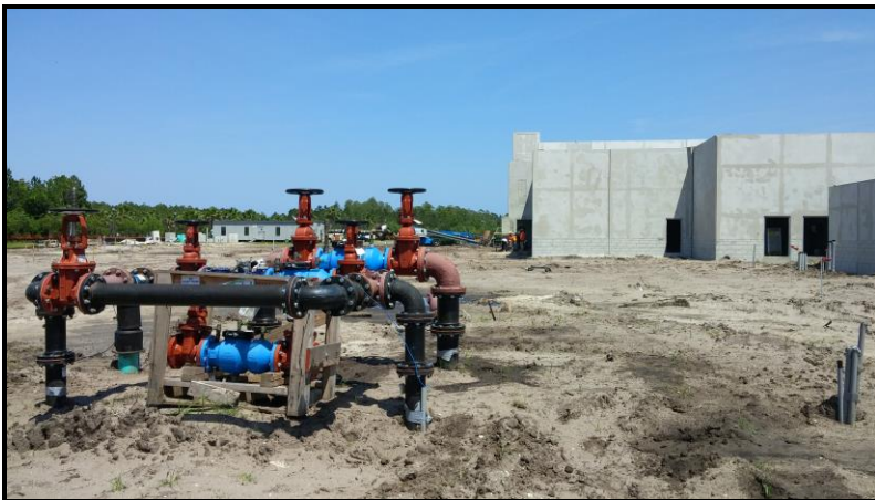
City Hall water meter assembly