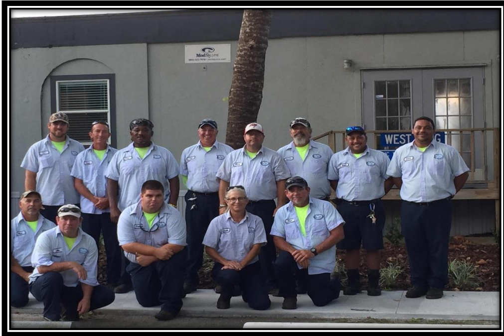
Landscape Crew, Public Works