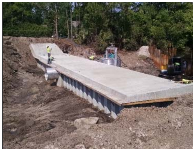
PA-1 Water Control Structure