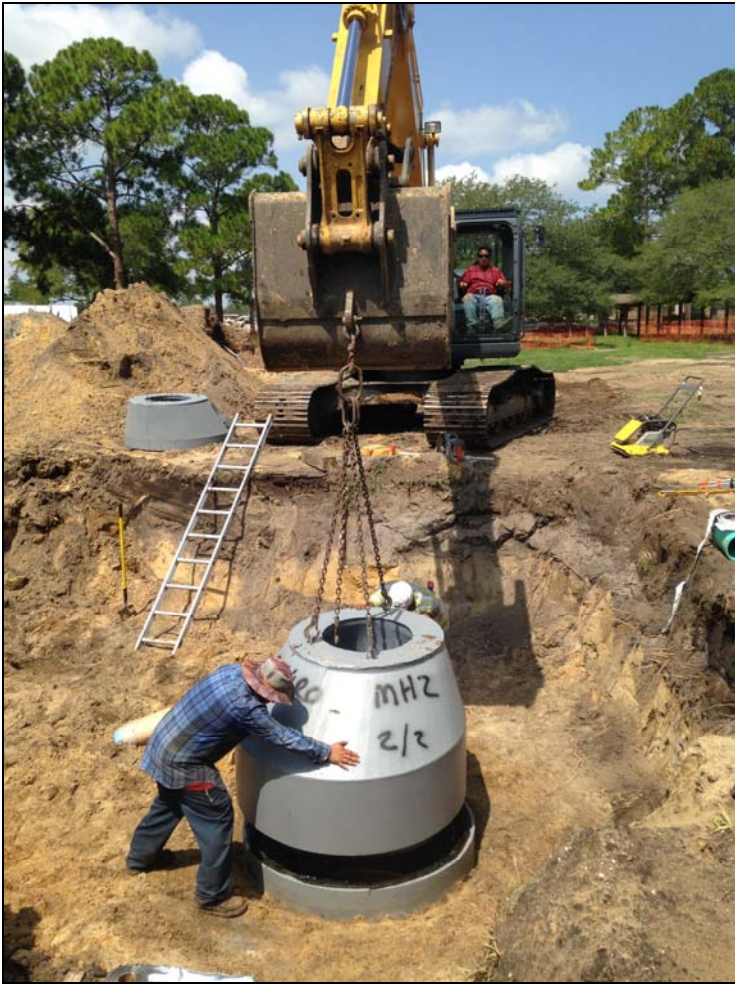
Sanitary Sewer Installation at Holland Park