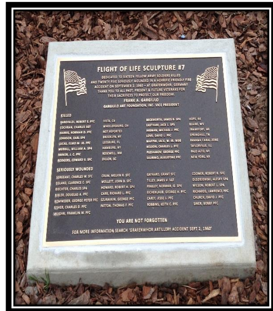
Birds of Flight sculpture and memorial plaque installed at Waterfront Park