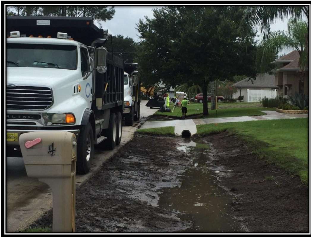
Swale Rehab on Collier Court