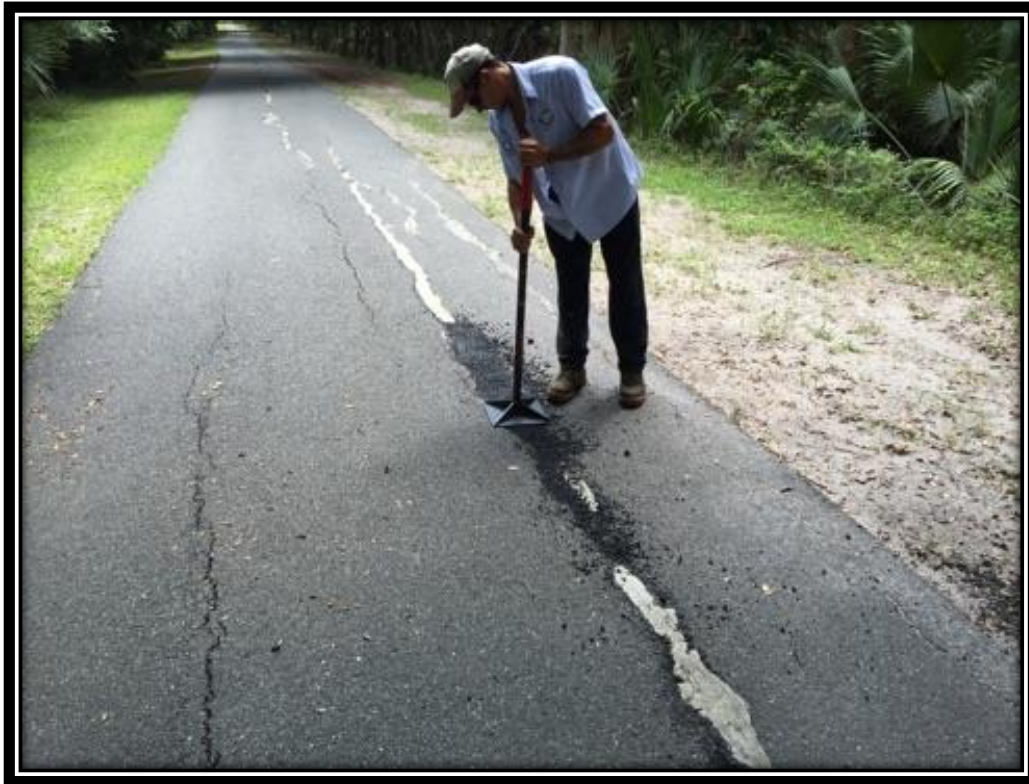
Crack Repair at St. Joe Walking Trail