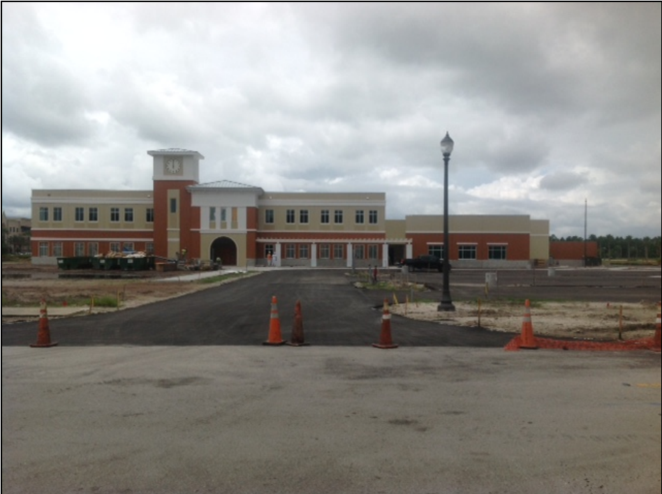
New City Hall Project