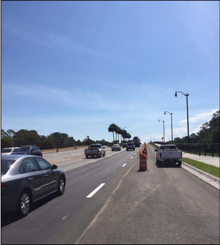
Palm Coast Pkwy. Overpass Looking East