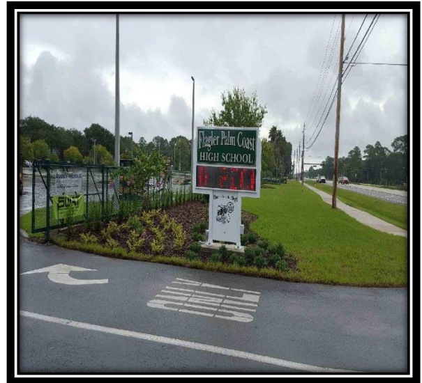
FPC High School Landscape Project is 100% Complete