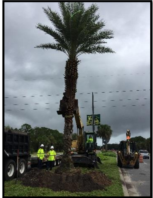
Planting Date Palm Tree Palm Coast Parkway