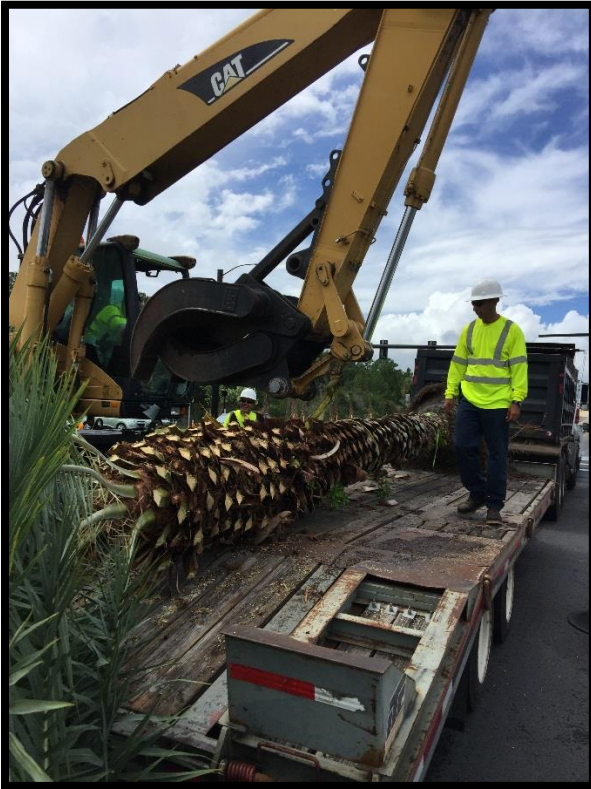
Relocated Date Palm Tree