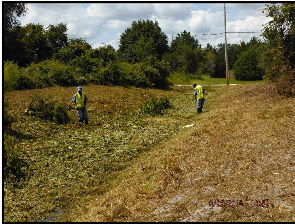
After - Ditch Maintenance Louisiana Drive