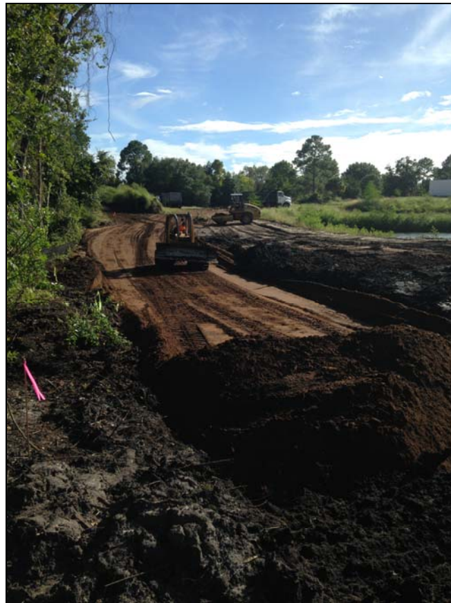
Holland Park Renovations