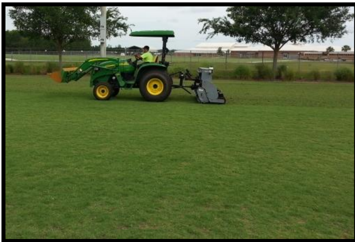
Aerating Sports Fields