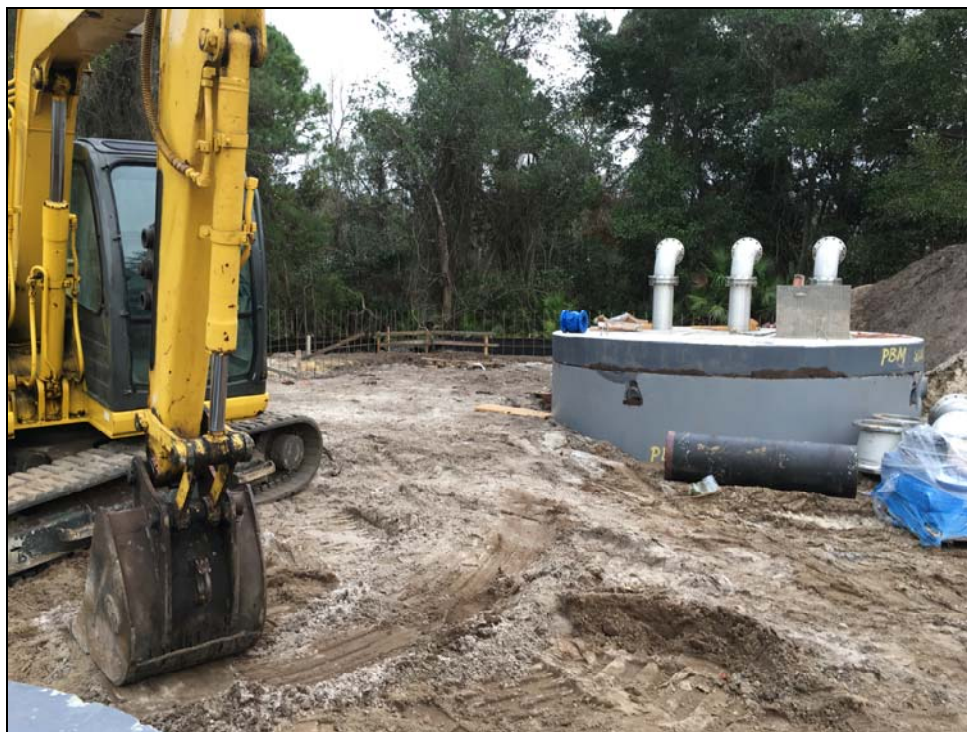
Stainless Steel Piping Inside Wet Well at Old Kings Rd. Master Pump Station