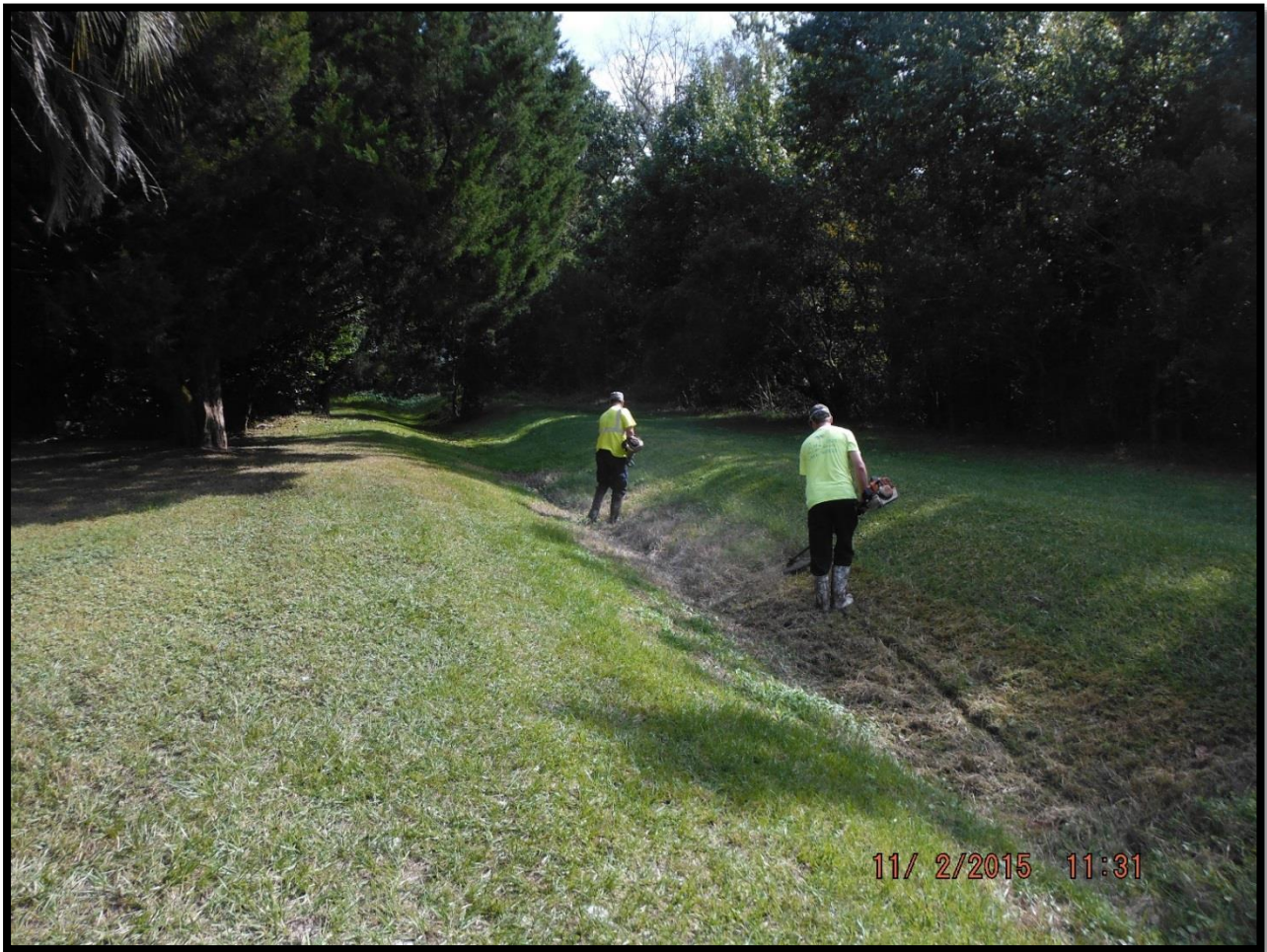
Ditch Maintenance on Farmbrook Lane