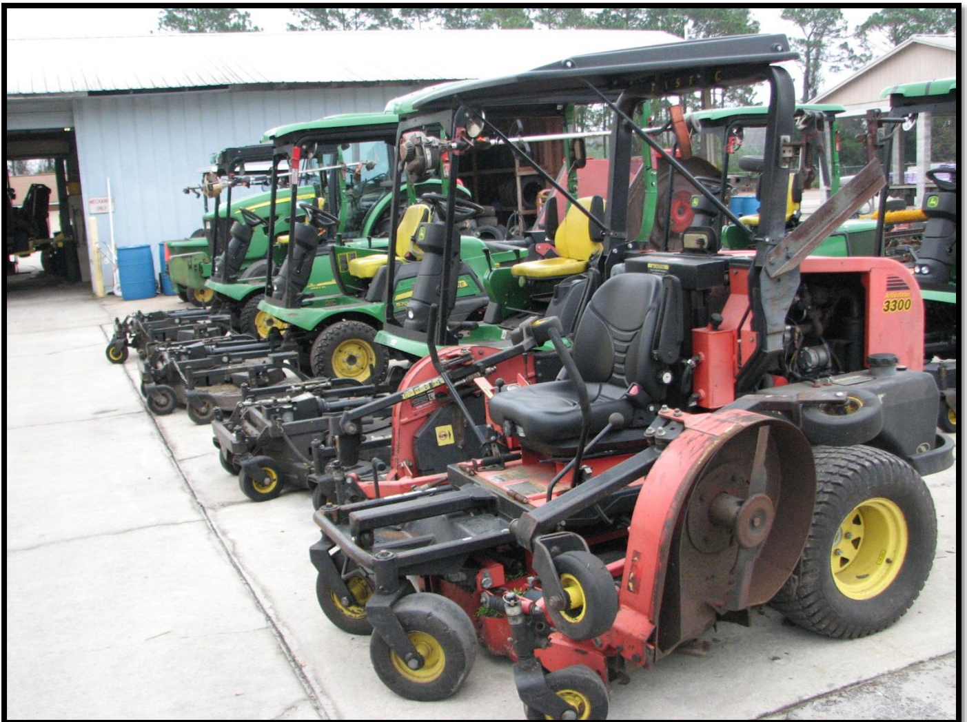
Mower Fleet in for Maintenance and Repair