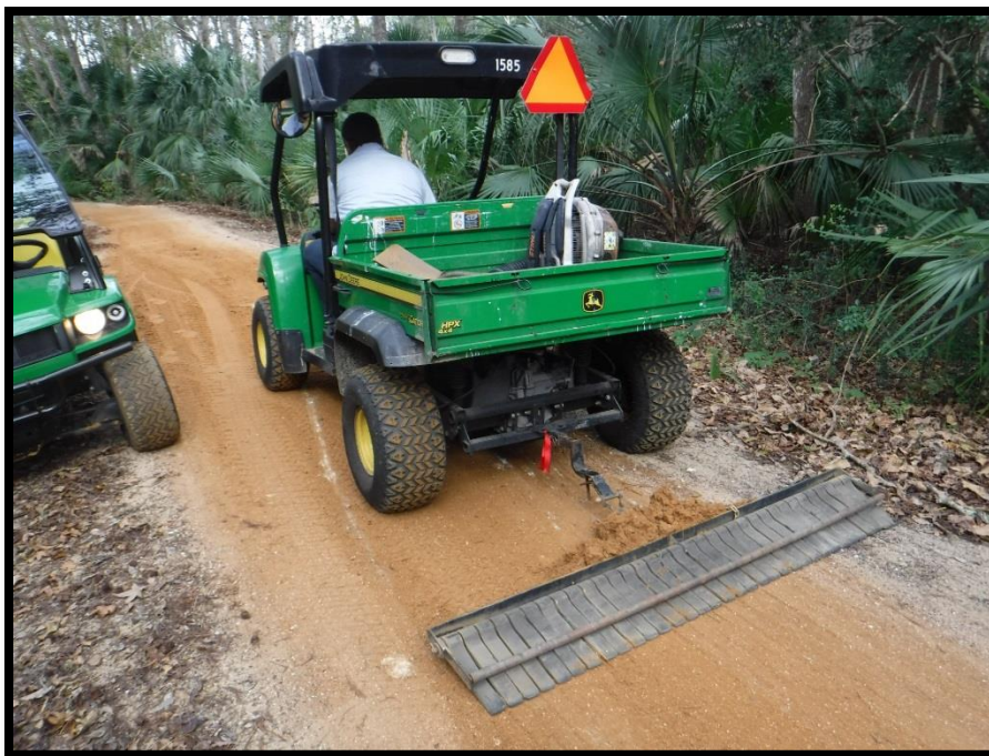
Grading Live Oak Trail