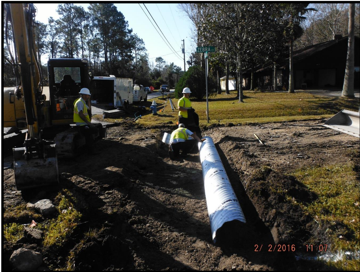
Installed Valley Gutter on Zebra Court