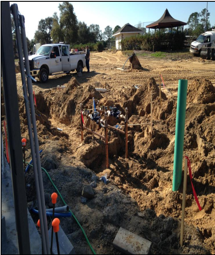
Holland Park Meter Installation