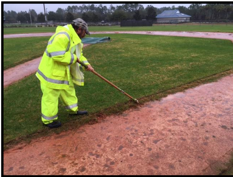
Edging Baseball Fields at Indian Trails Sports Complex