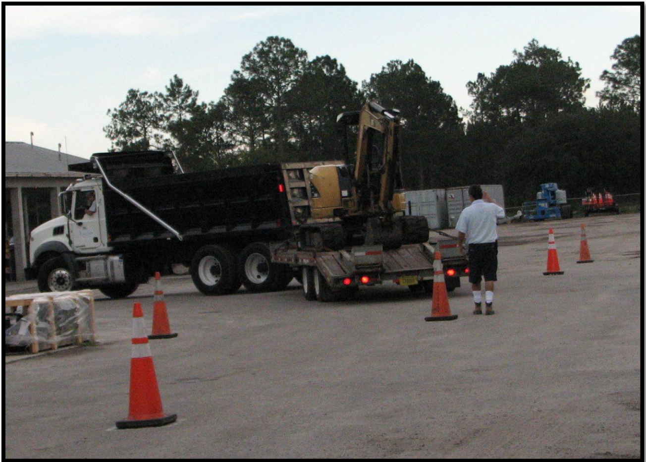
Training for Commercial Driver's License