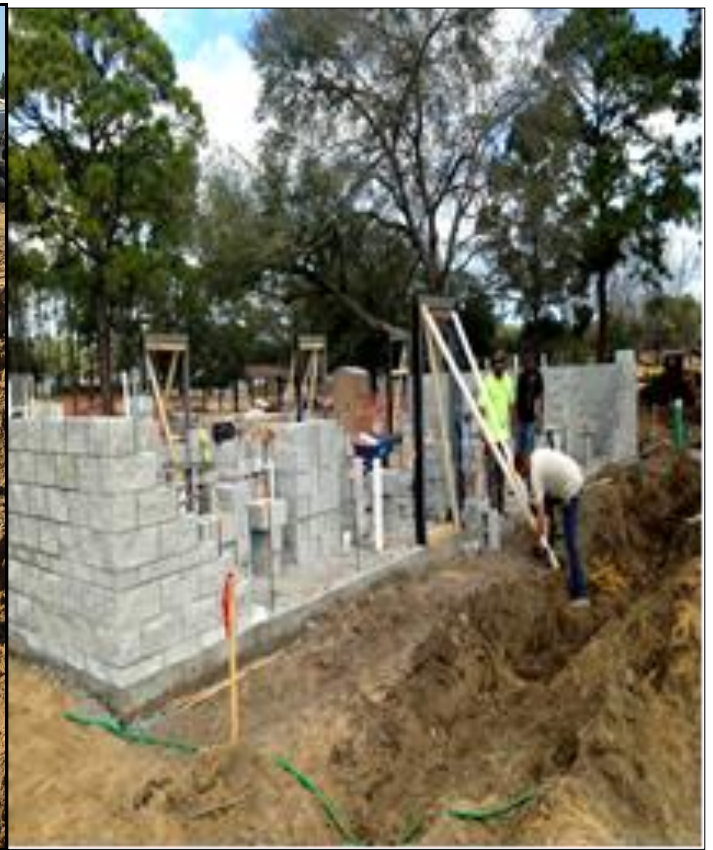
Holland Park Restroom Building