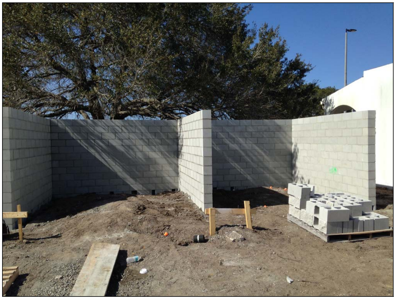
Holland Park Material Storage Bin