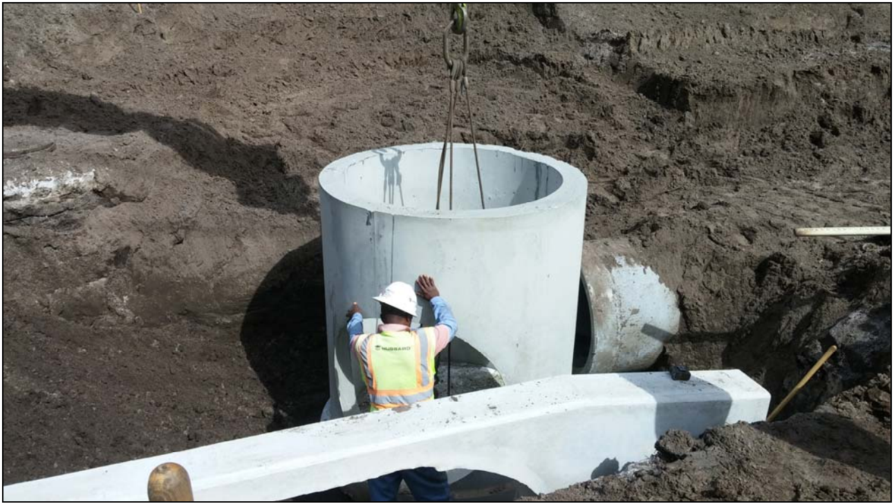
Palm Harbor Stormwater Head Wall on Forest Grove