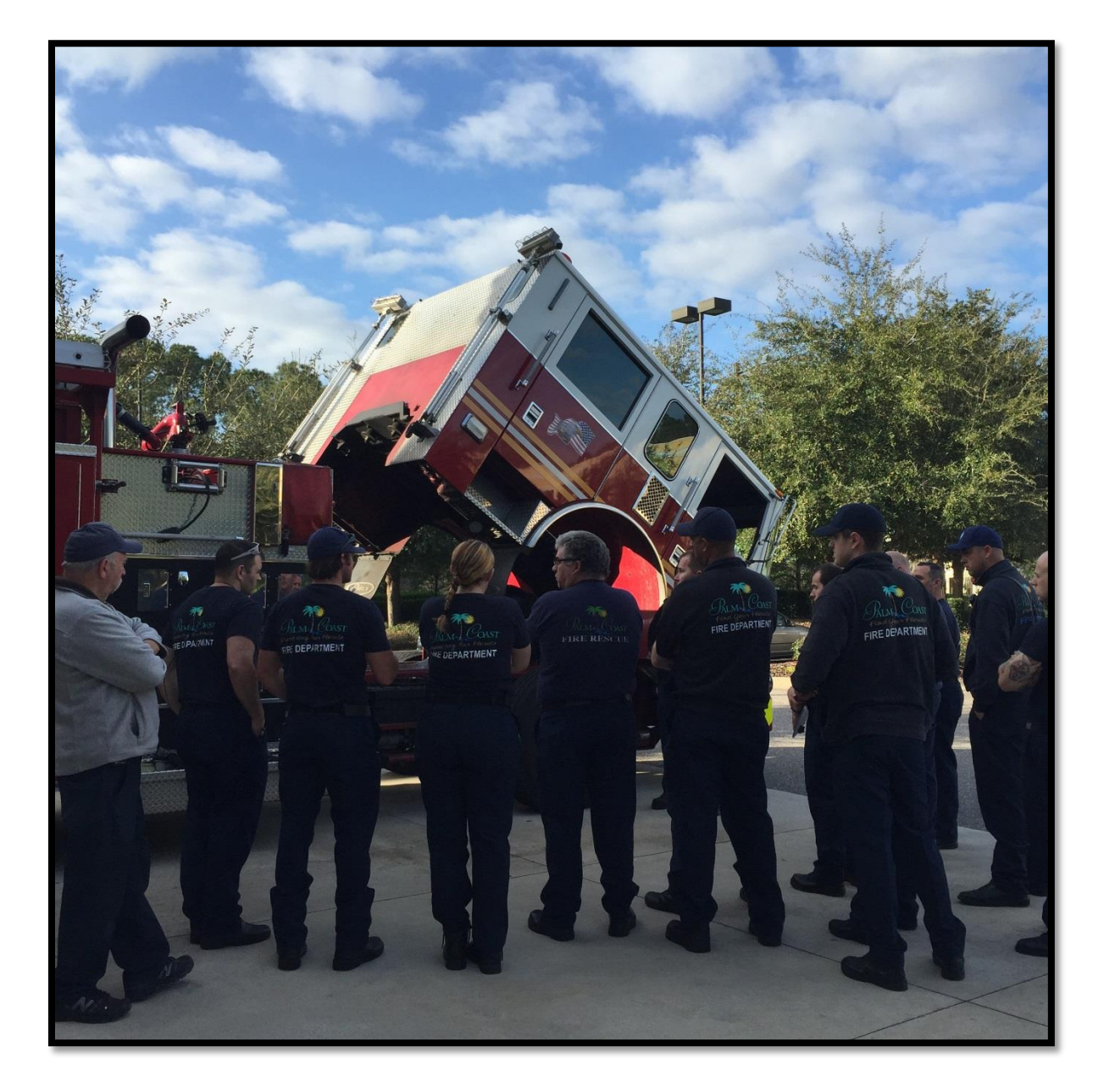
Pre-Trip Vehicle Inspection Training for Fire Personnel