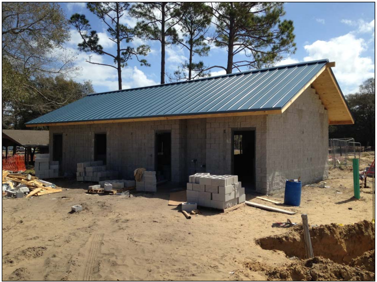
Holland Park Restroom