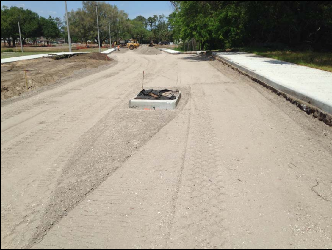
Holland Park - Road Base