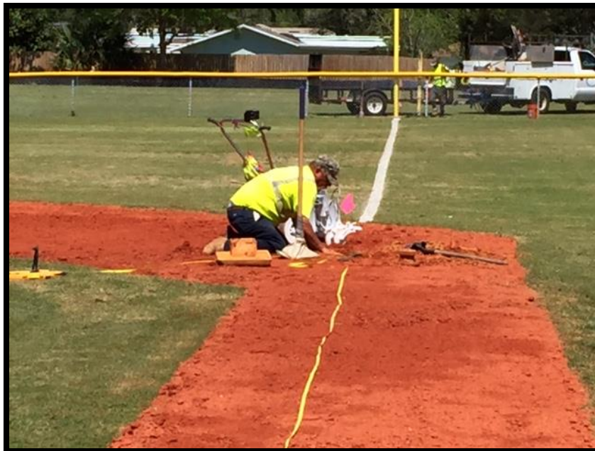
Prepared New Baseball Field at Holland Park