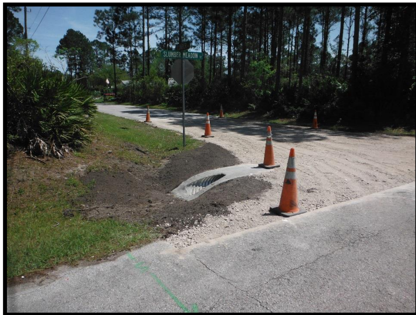
Valley Gutter Installation Slumber Path