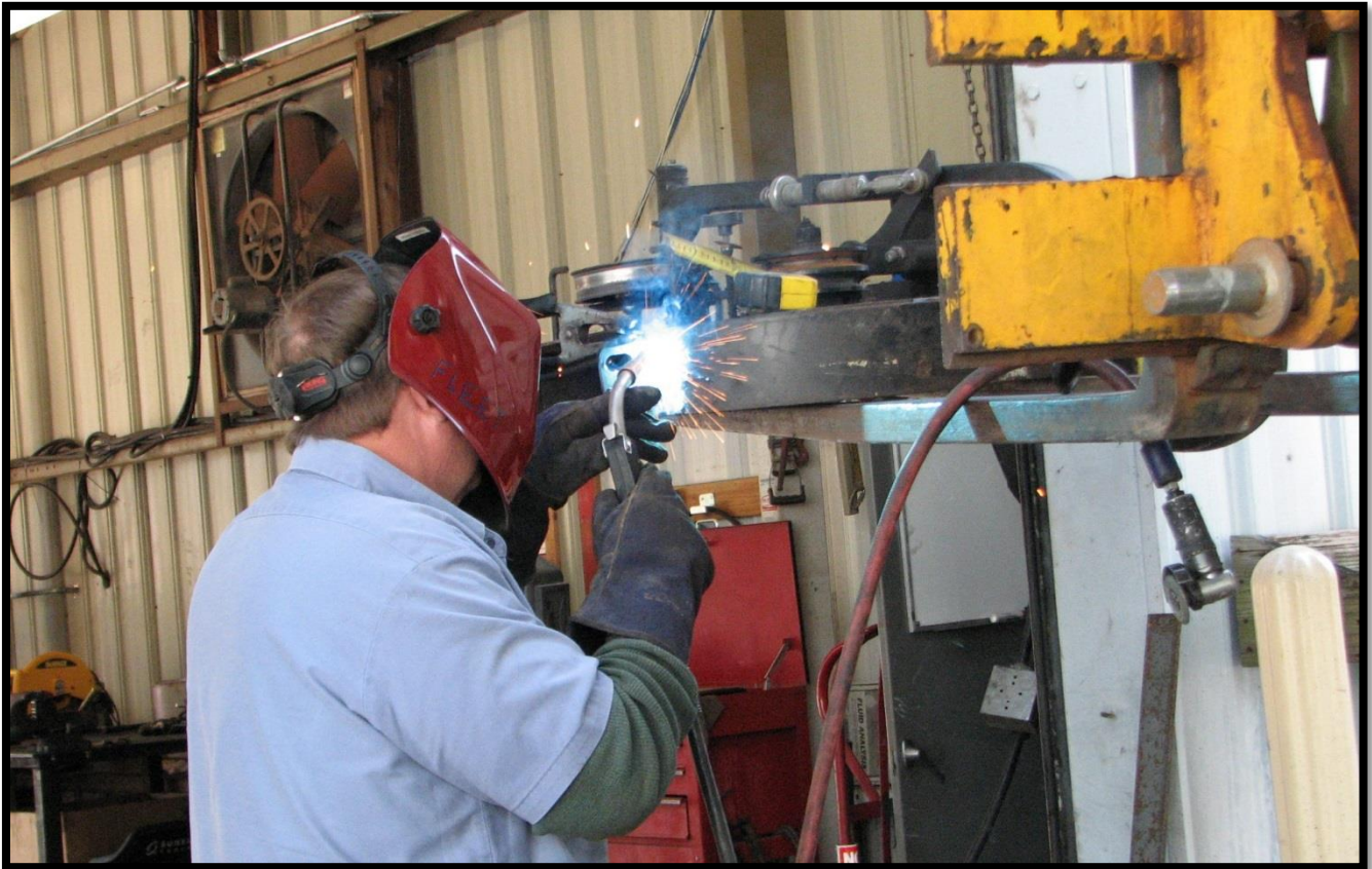
Welding Repair to Mower Deck