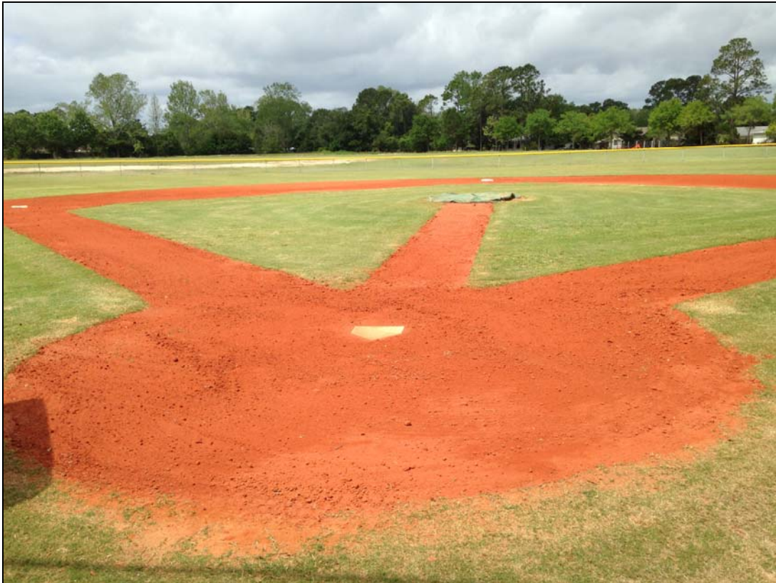
Holland Park - Baseball Field