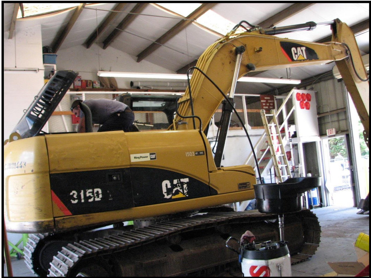
Repairing Air Conditioner – Track Excavator