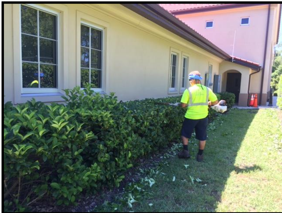
Hedge Trimming – Fire Station 24