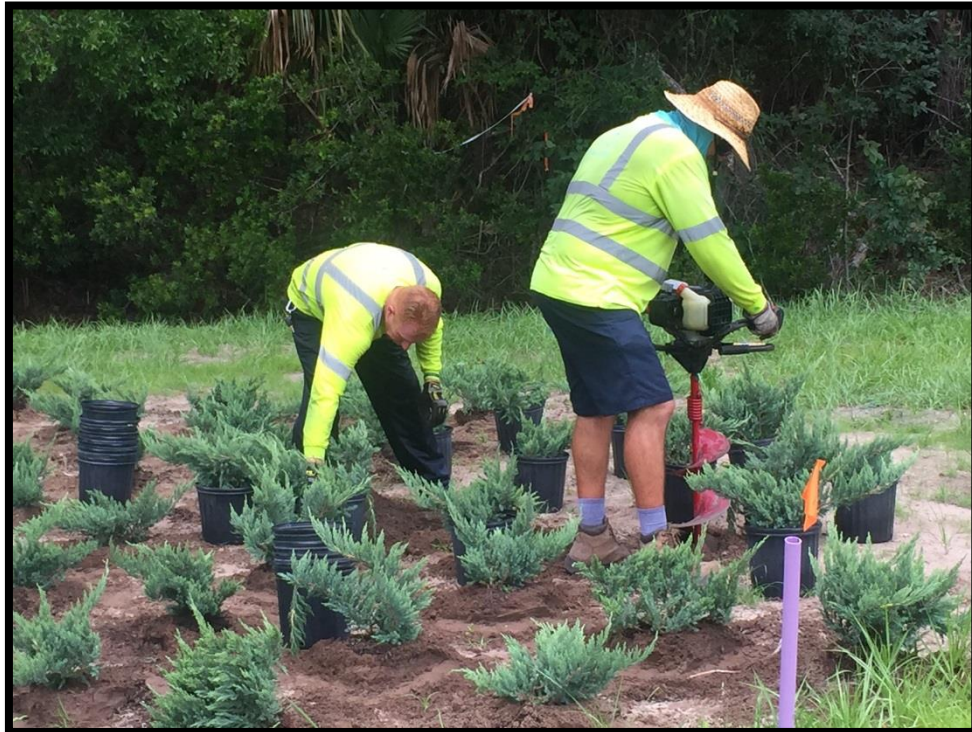
Plantings for Palm Harbor Extension Project