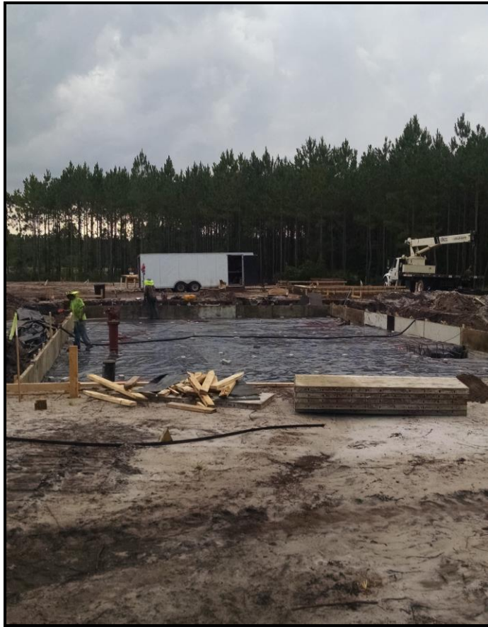
Waste Water Treatment Plant 2 Sludge Holding Piping PSI Test