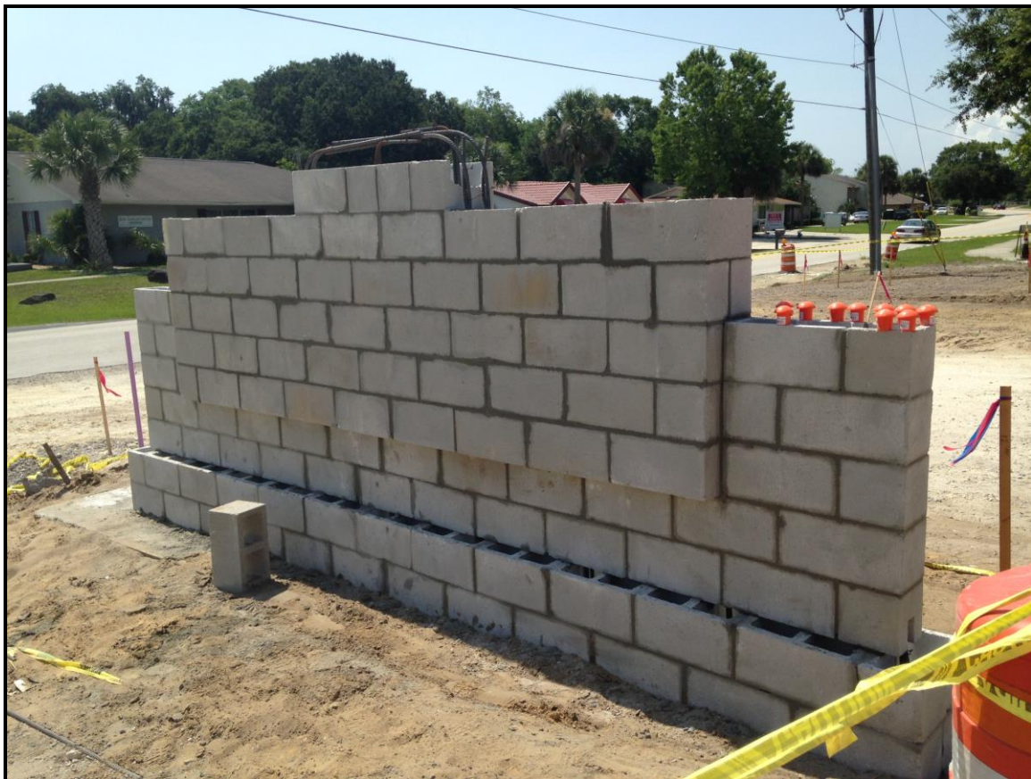
Holland Park - Monument Entry Sign