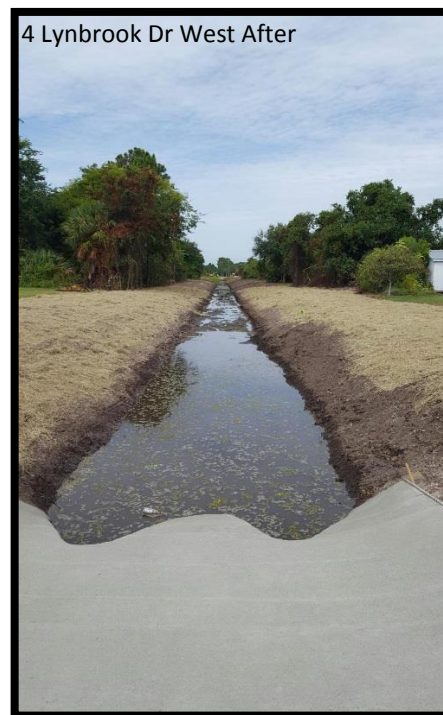
Stormwater Modeling - Lynbrook Drive