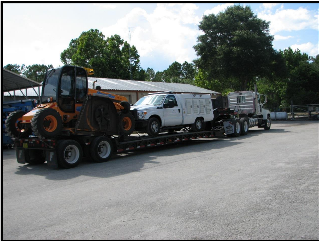
Transporting Fleet on Low Boy Tractor Trailer