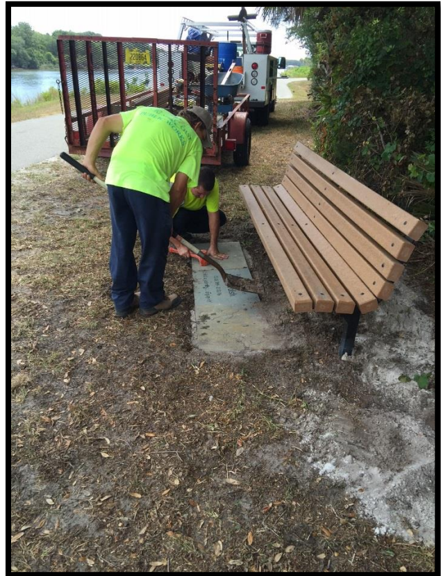
Bench & Memorial Installation - Children's Memorial Park