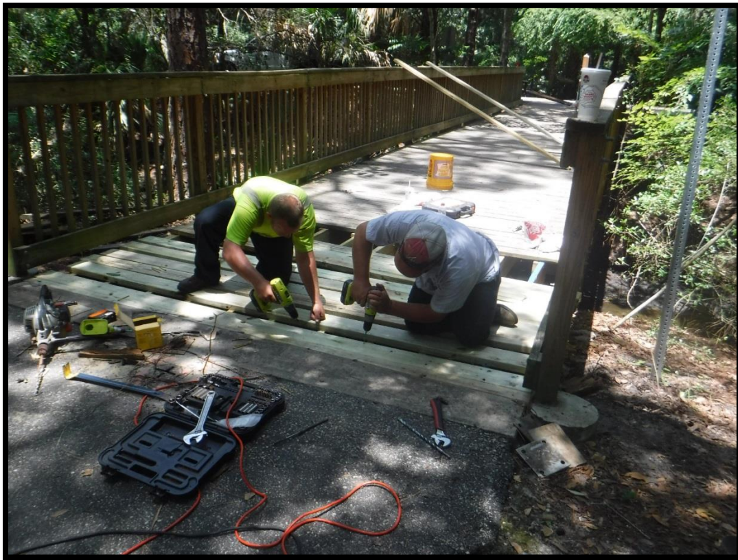
Pedestrian Bridge Repair - Linear Park

Activities for the Week of August 5, 2016