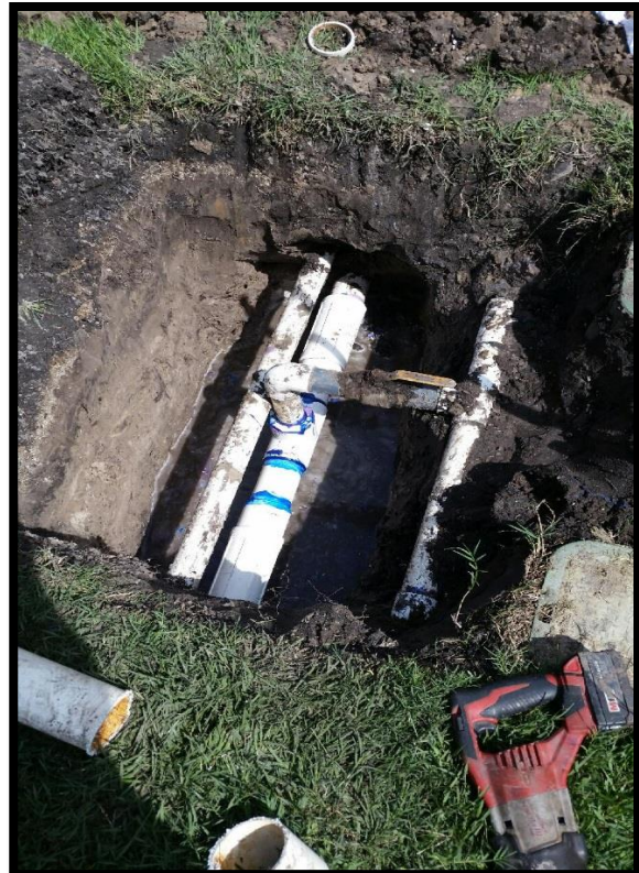
Irrigation Repair - Belle Terre Parkway