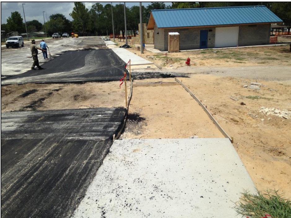
Holland Park Update