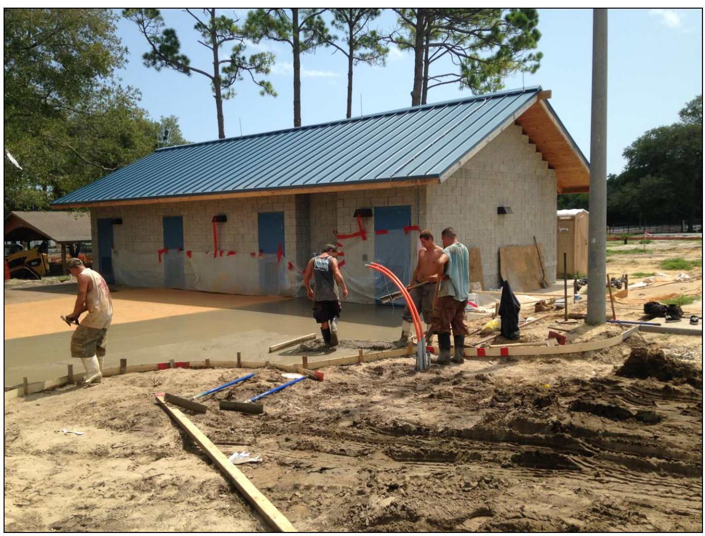
HOLLAND PARK - COLORED CONCRETE PAD