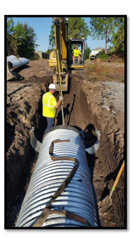
Stormwater Modeling - Sec. 37 Trib 3