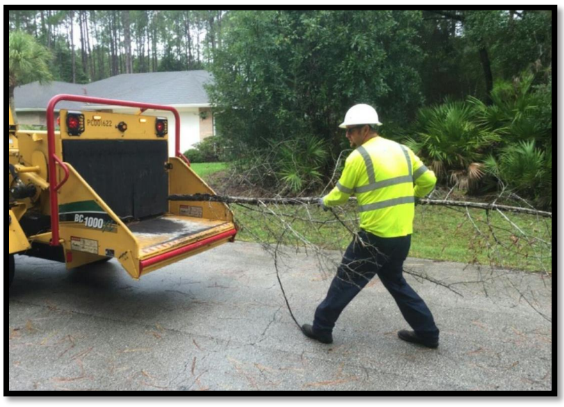
Storm Cleanup - Hurricane Hermine