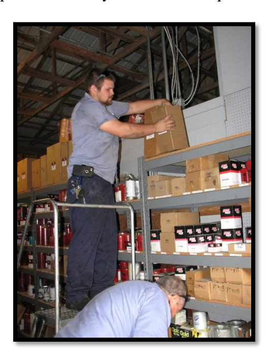
Organizing Parts Room