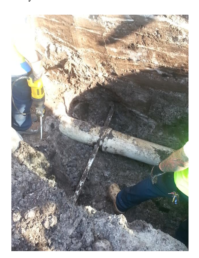
Sewer Main repair on Ferber Lane