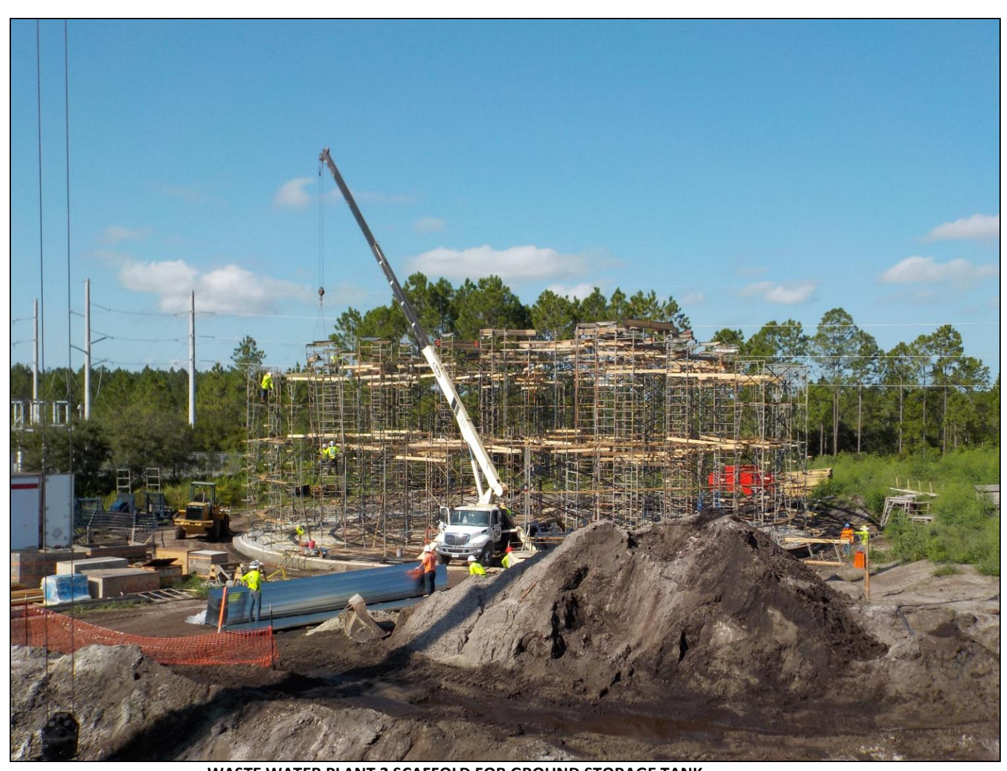
WASTE WATER PLANT 2 SCAFFOLD FOR GROUND STORAGE TANK