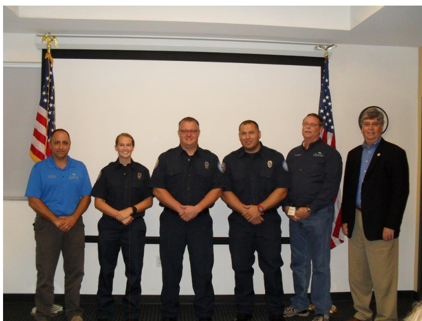
New Hire Orientation Pinning Ceremony