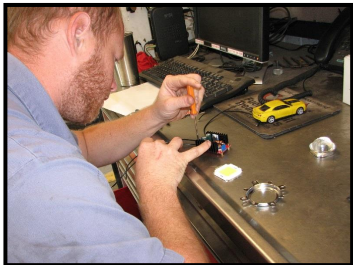
LED Light Repair