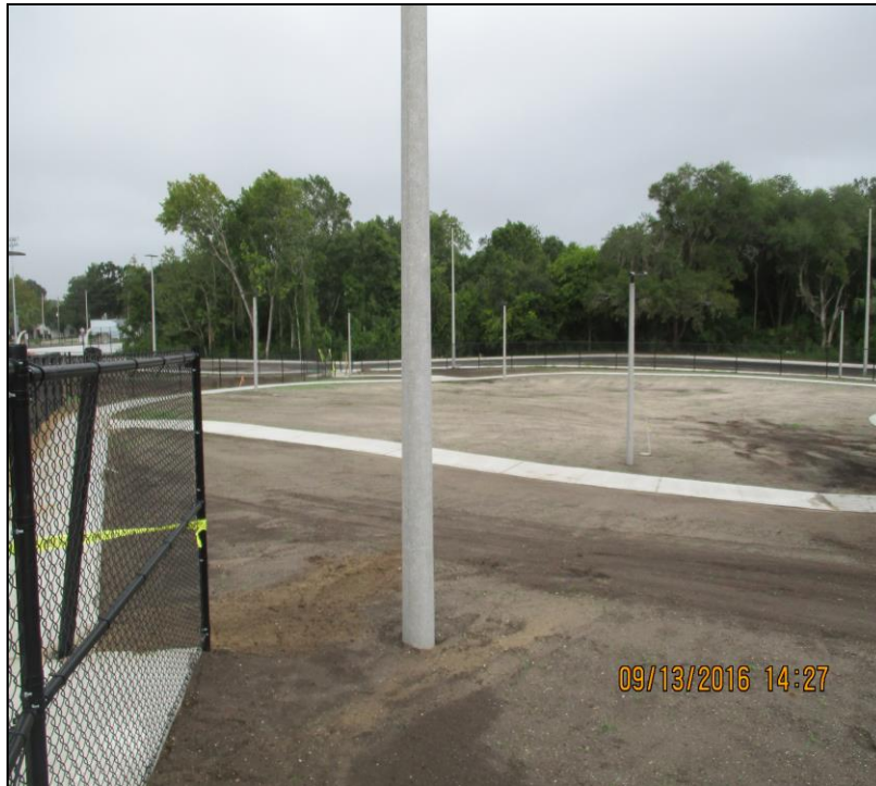
HOLLAND PARK - DOG PARK