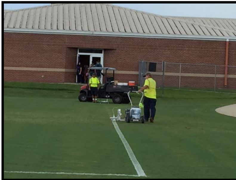
Aerating and Painting Sports Fields