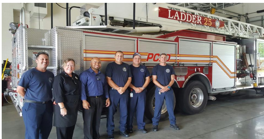
Local Olive Garden Appreciation Visit