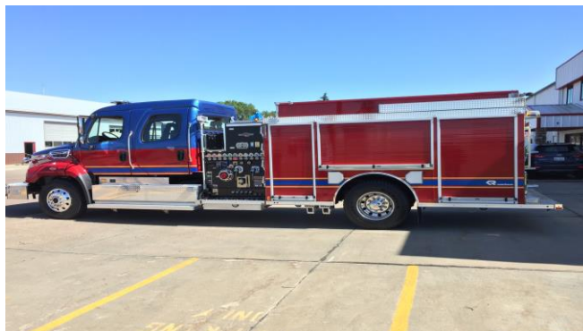
One of the Twins