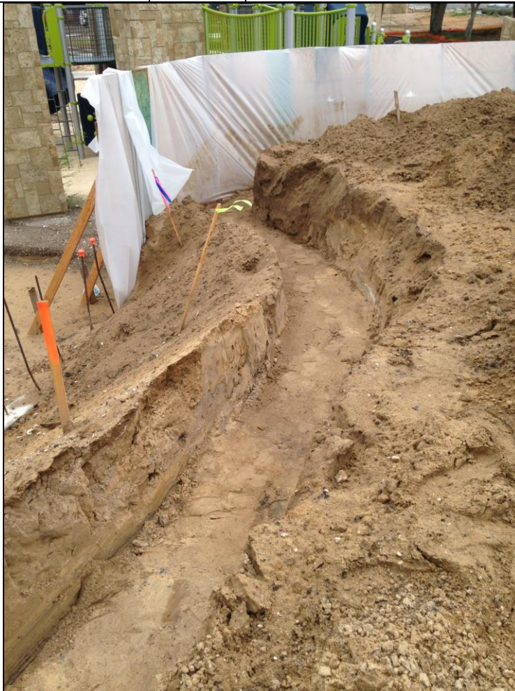
HOLLAND PARK - UPPER PLAYGROUND ROCK WALL FOUNDATION