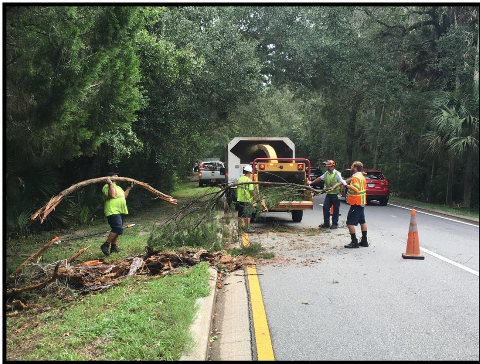
Hazardous Tree Removal - Palm Coast Parkway