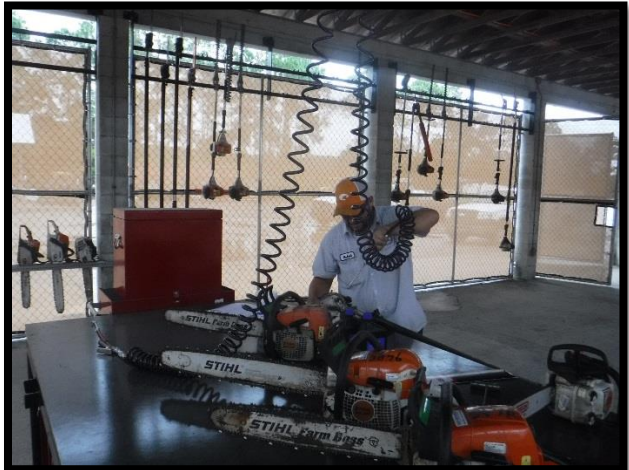
Cleaning & Servicing Chain Saws