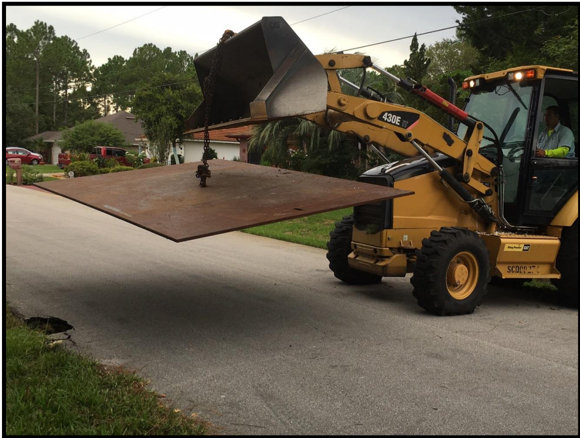
Emergency Road Plate – Drainage Pipe Failure Potters Lane