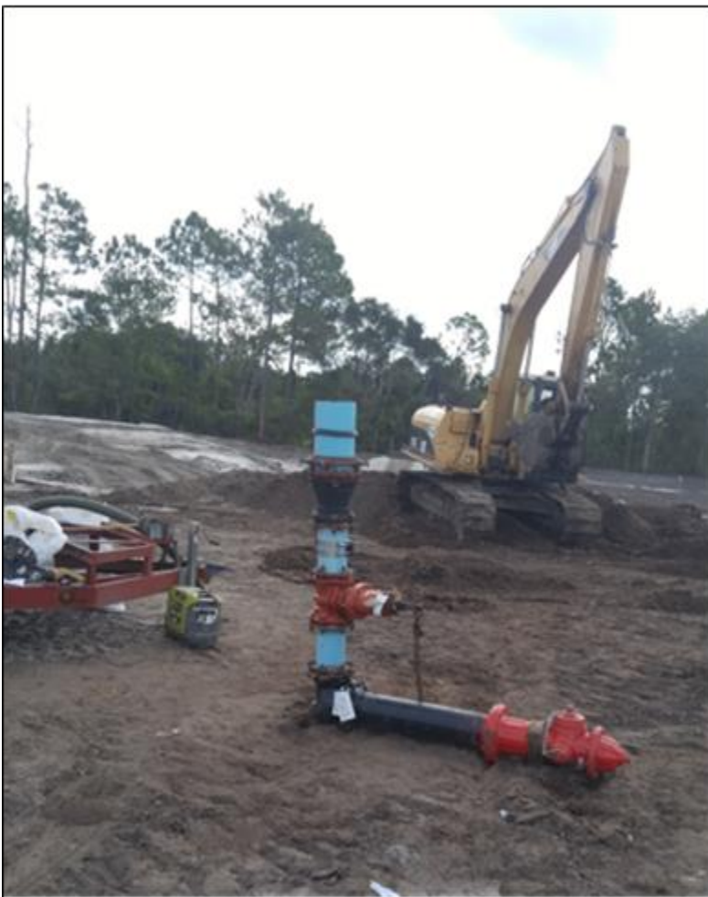
NEW HYDRANT INSTALL @ SHOPPES OF PALM COAST