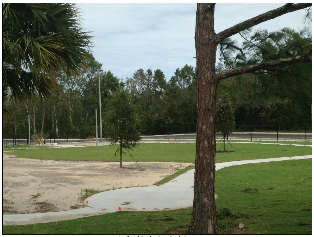
Holland Park - Dog Park Area