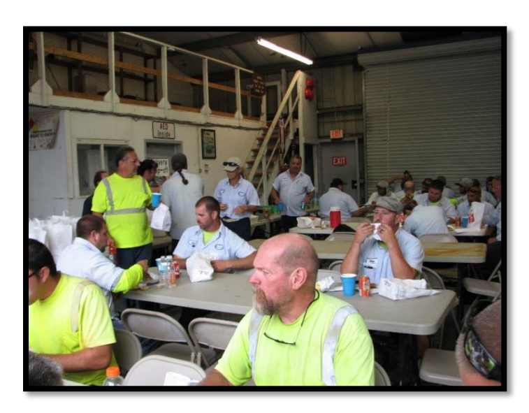
Thank You For Your Hard Work