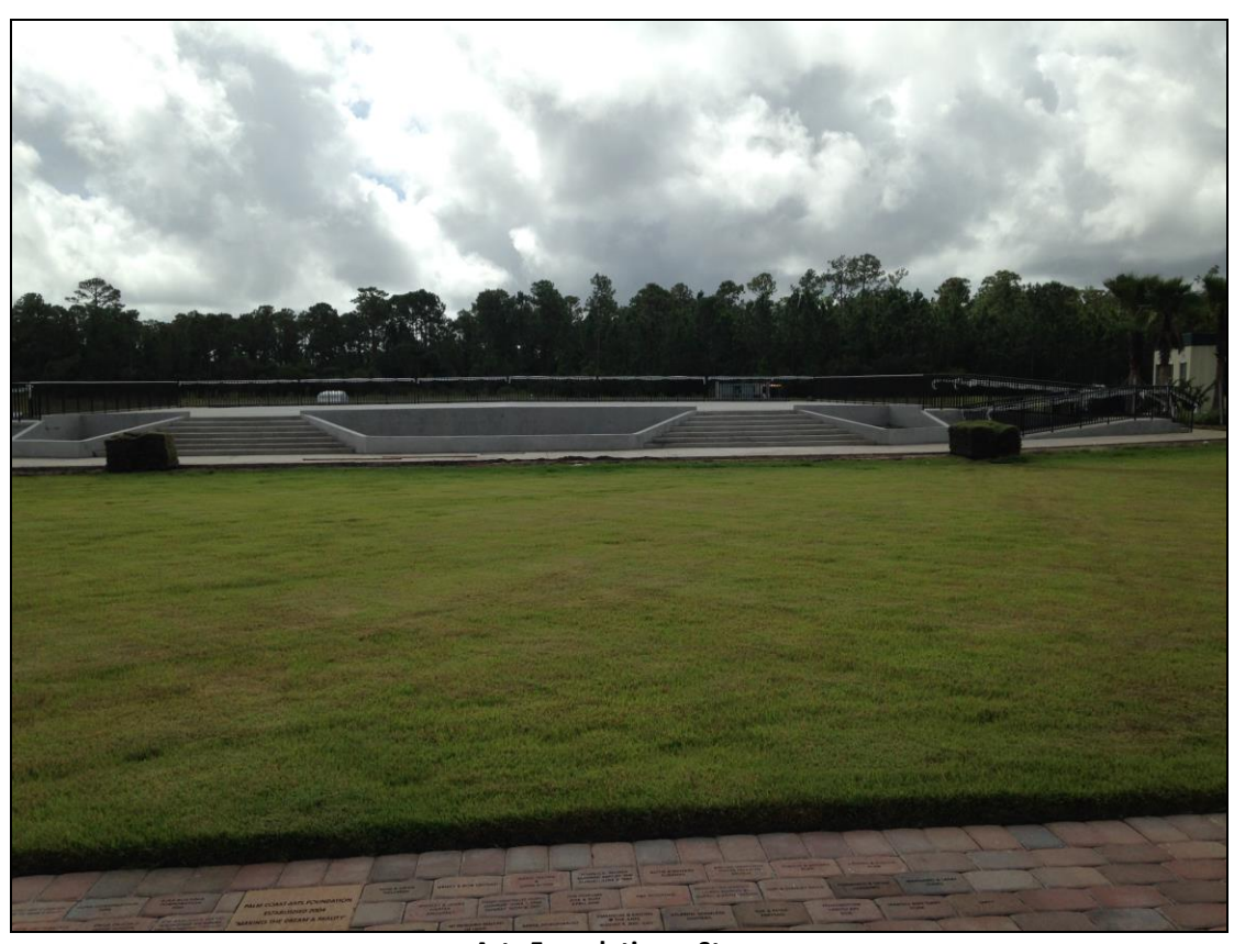
Arts Foundation – Stage