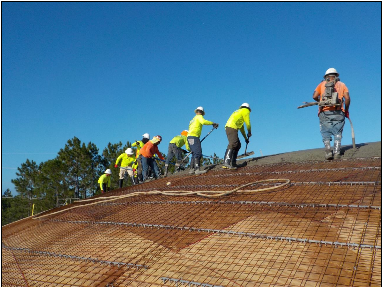
Waste Water Treatment Plant 2- Ground Storage Tank (Shot-Crete) Concrete Finish on Dome