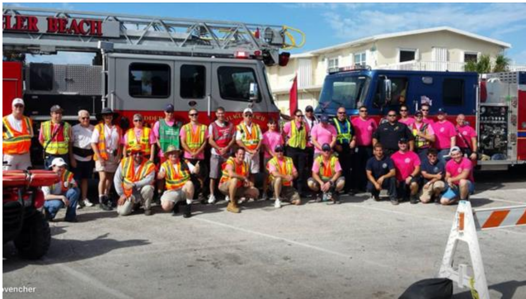
Flagler Beach & COPC Fire & Rescue / Beach Clean-up