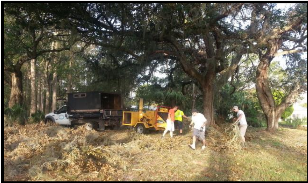
Palm Harbor Golf Course