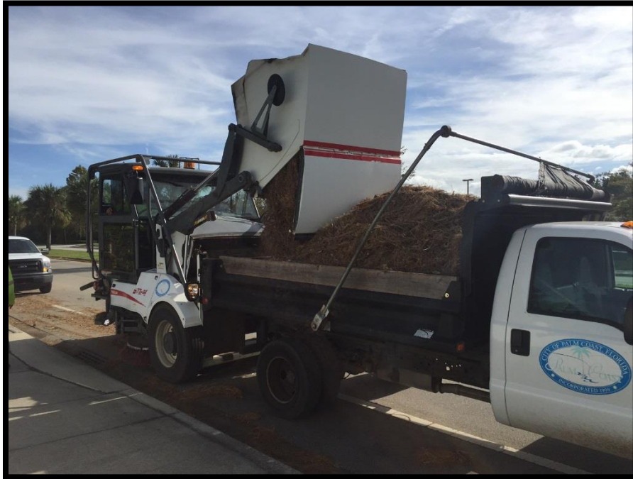
Street Sweeper - Belle Terre Parkway