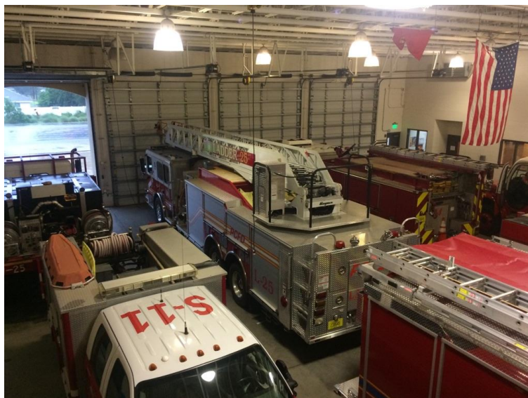
Station 25 Bay/Hurricane Matthew

The City of Palm Coast Firefighters were recognized by Muscular Dystrophy Association for their hard work and dedication in their fundraising efforts for the Fill the Boot Drive this year.