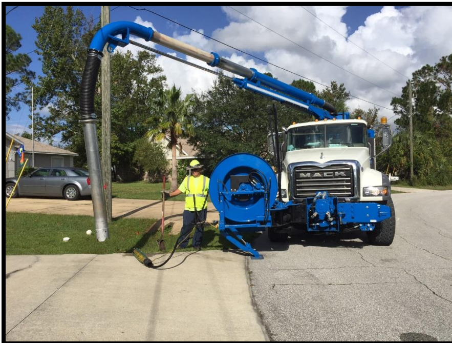
Vac-Con Cleaning Driveway Culverts