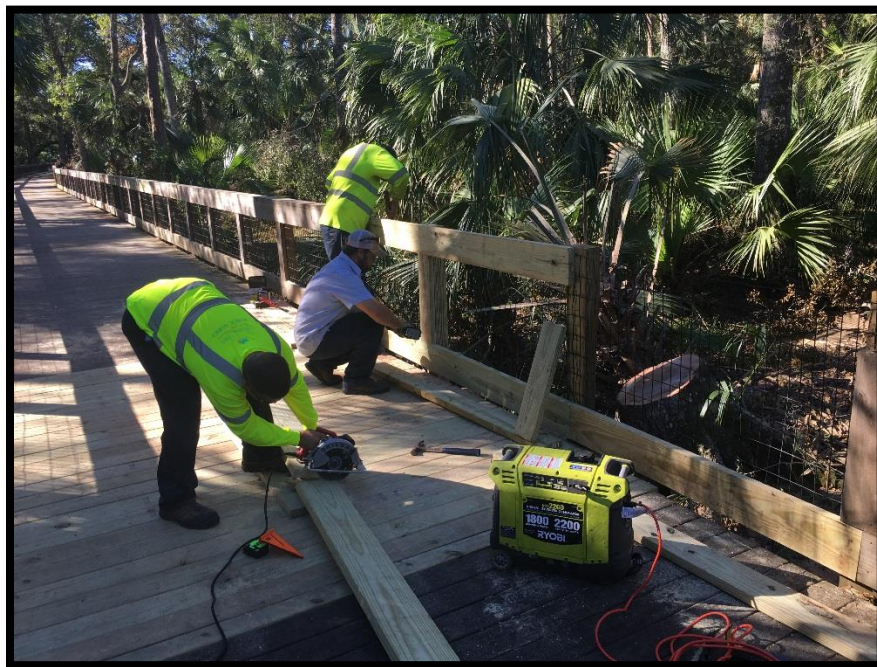
Graham Swamp Boardwalk Repairs