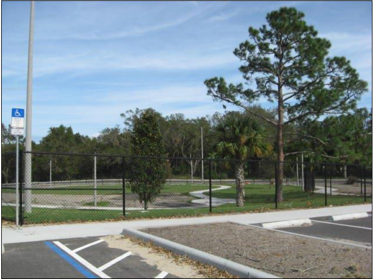
Holland Park - Dog Park