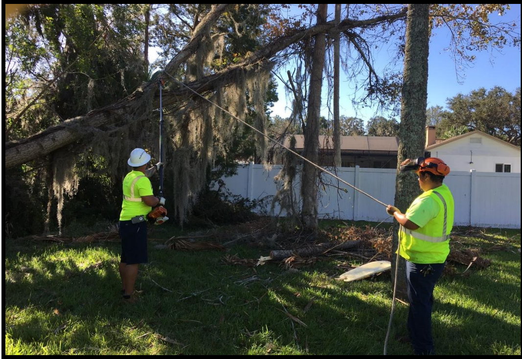
Hazard Tree Removal