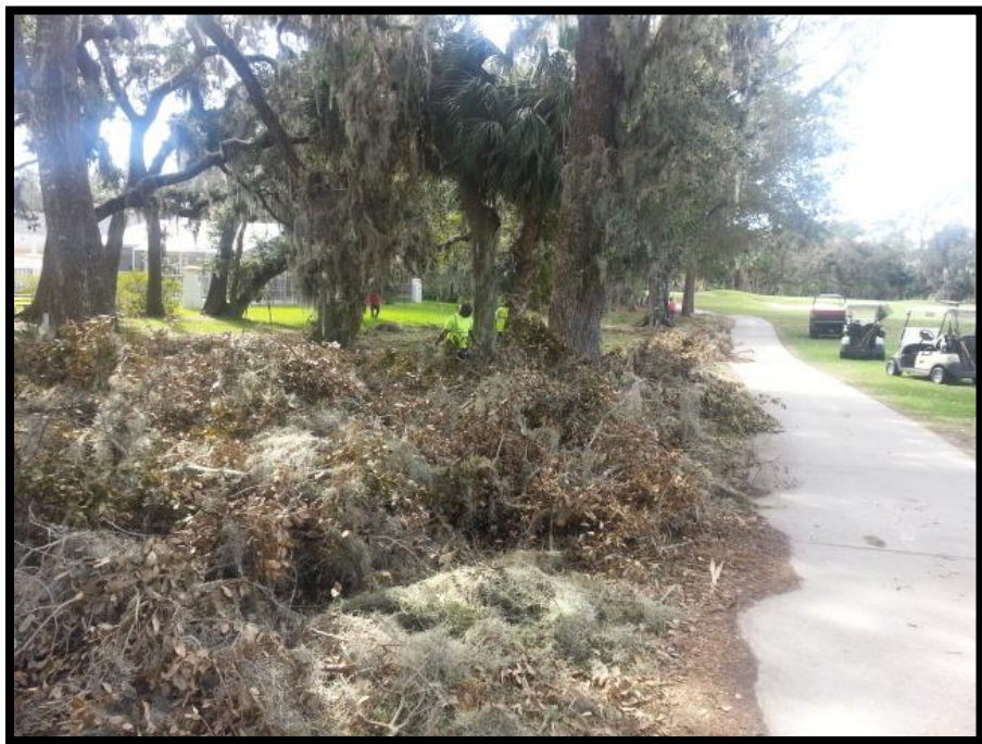
Palm Harbor Golf Course Clean-up