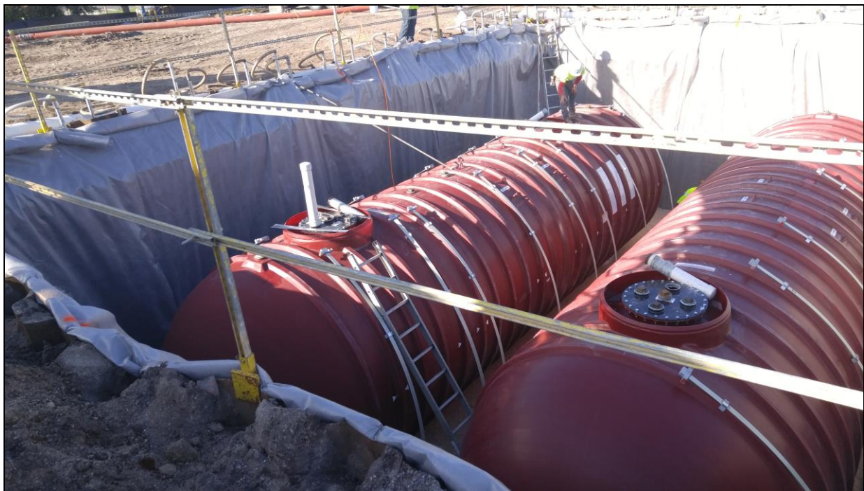
7-Eleven Fuel Tanks