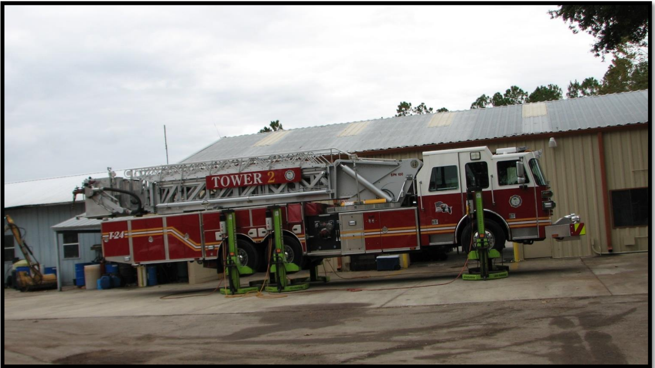
Fire Apparatus Repair/Maintenance