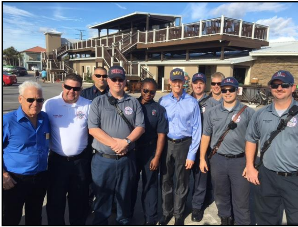
Governor Rick Scott with Flagler Beach and City of Palm Coast Fire & Rescue Crews