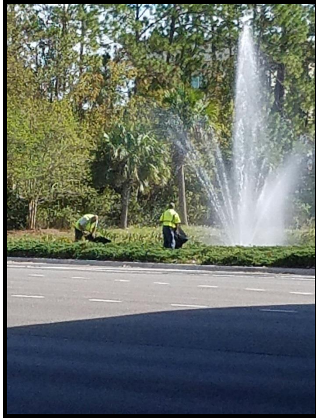
SR 100 Median Maintenance