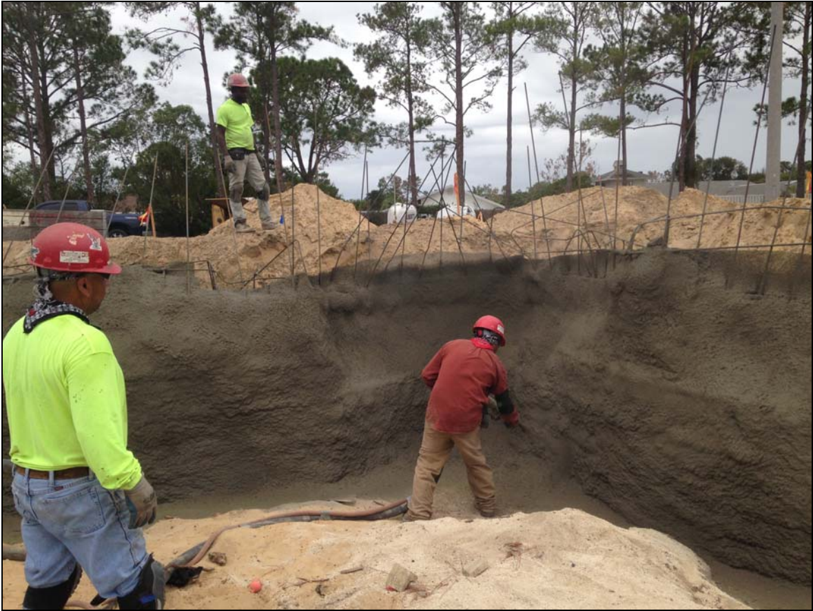
Holland Park - Artificial Rock Wall