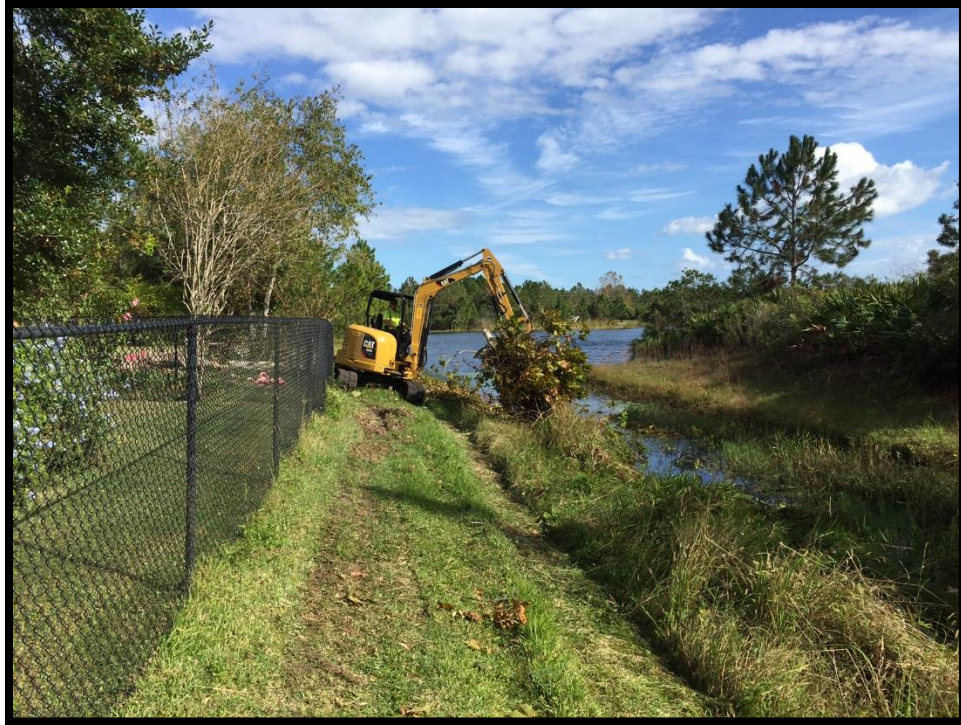
Drainage Ditch Debris Removal - Ula Turn Trail