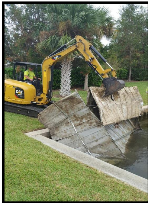
Debris Removal Continues