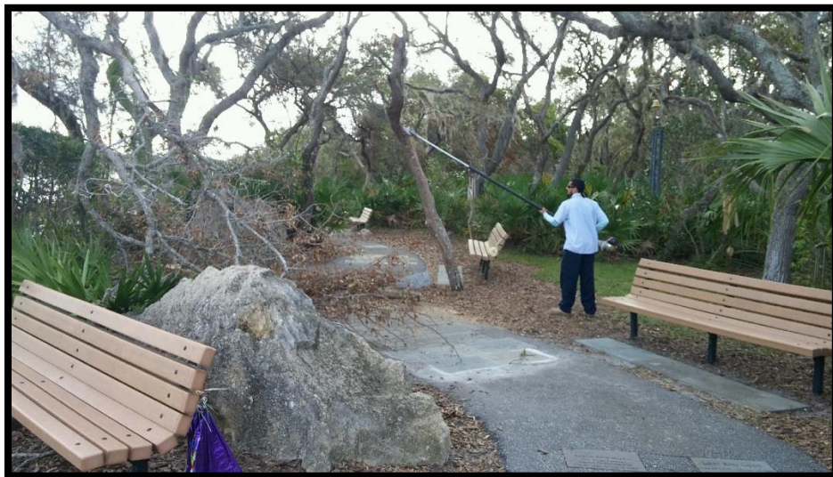
St Joe Walkway Clean-up