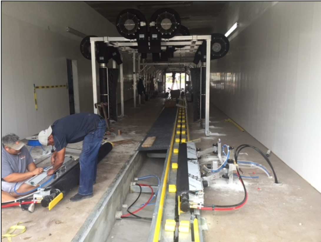
Drive through Car Wash @ Super Wash