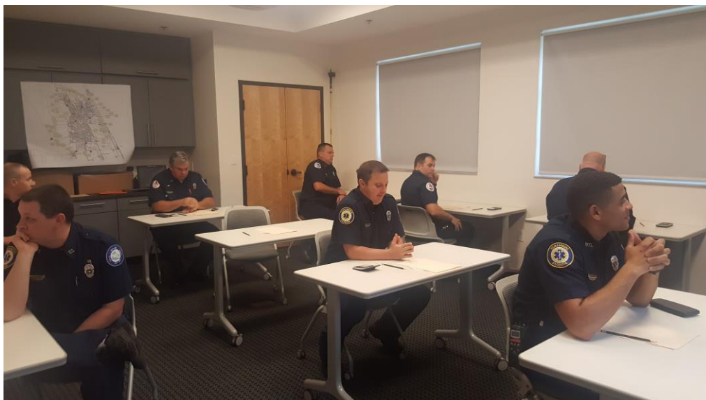
Day 1 - Written Exam

Driver testing has been in full-effect all week. On Monday, the firefighters went through a written exam which included hydraulic formulas and street map questions. The following two days they went through pumping assessments, which is knowledge of proper pumping procedures, pressures, and use. Thursday's assessment consisted of aerial set-up and use of the aerial tower apparatus. We will be promoting 15 firefighters to driver engineers. We are also in the final stages of the Captains exam.