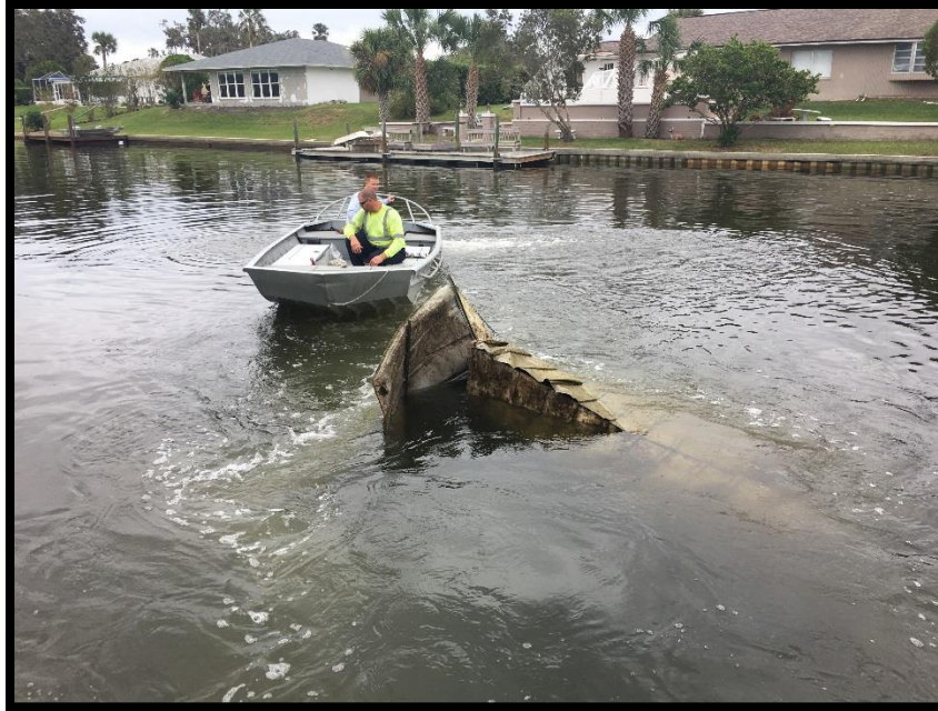
Storage Shed Removal from Waterway