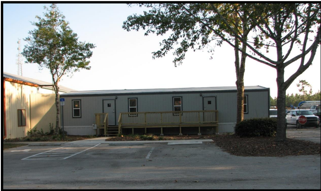
New Rental Office Facility