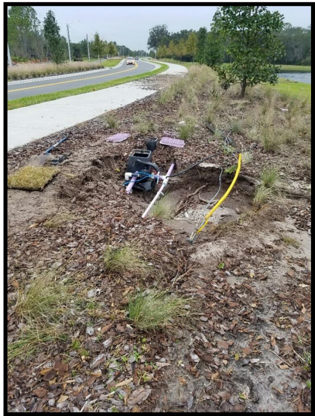
Irrigation Damage Repair - Palm Harbor Parkway