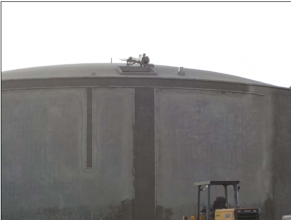
Waste Water Treatment Plant 2 Ground Storage Tank