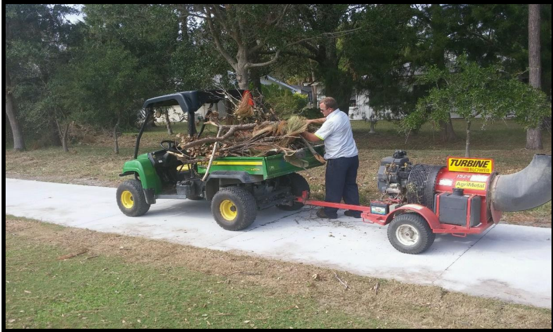
Cleanup on St. Joe Walkway