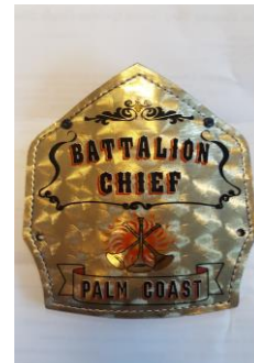
Battalion Chief Shield