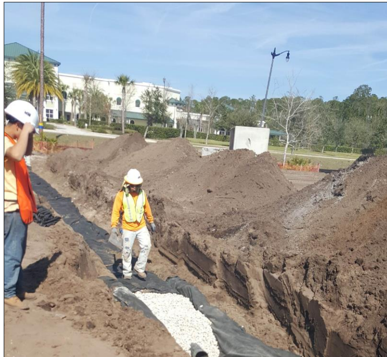
Florida Power & Light Site Parking Lot Underdrain