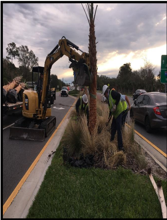
Palm Coast Parkway Tree Replacement