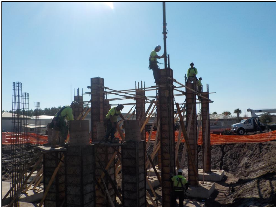
Waste Water Treatment Plant 2 Concrete Placement in Columns