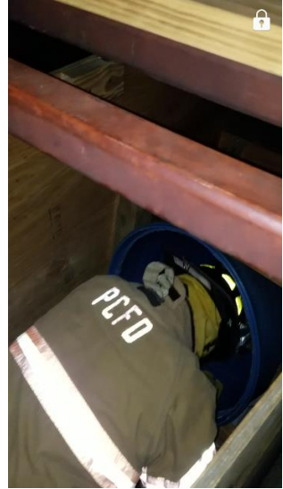
Firefighter Search and Rescue Training