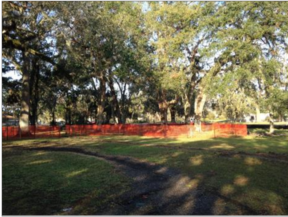
Community Center – Tree Barricades