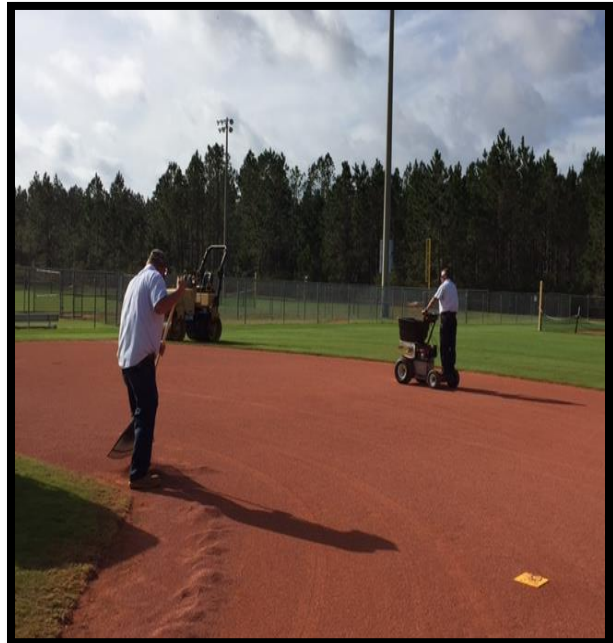
ITSC Baseball Field Restoration