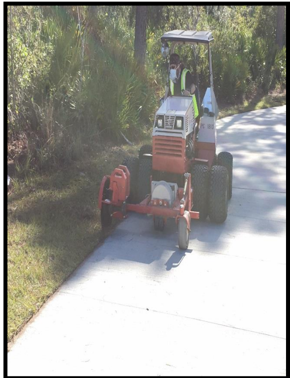
Seminole Woods Sidewalk Edging