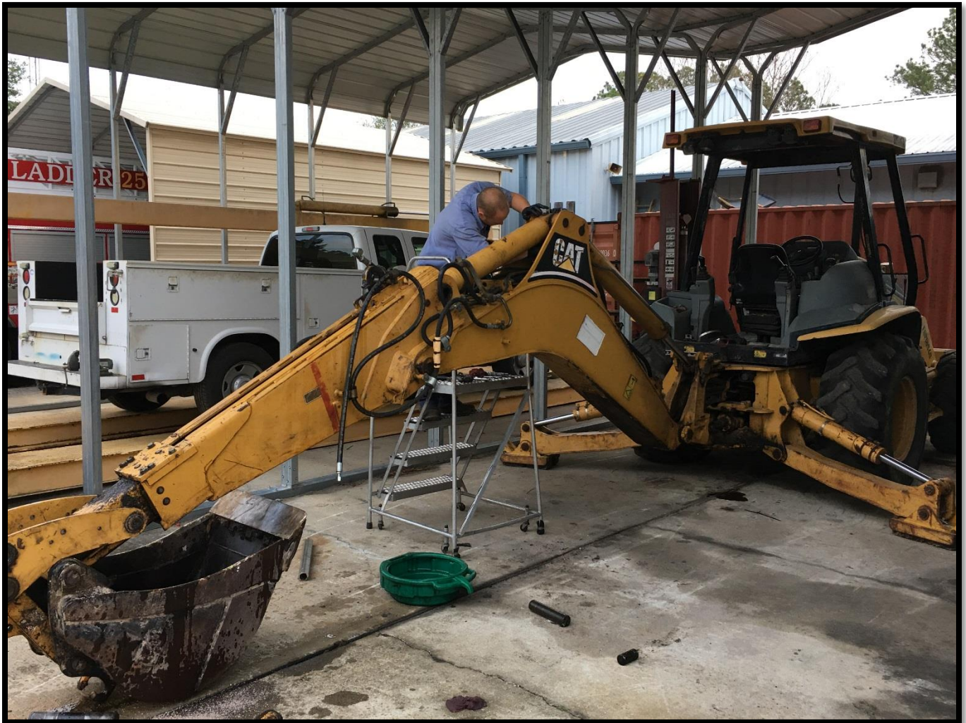
Hydraulic Line Repair on Backhoe