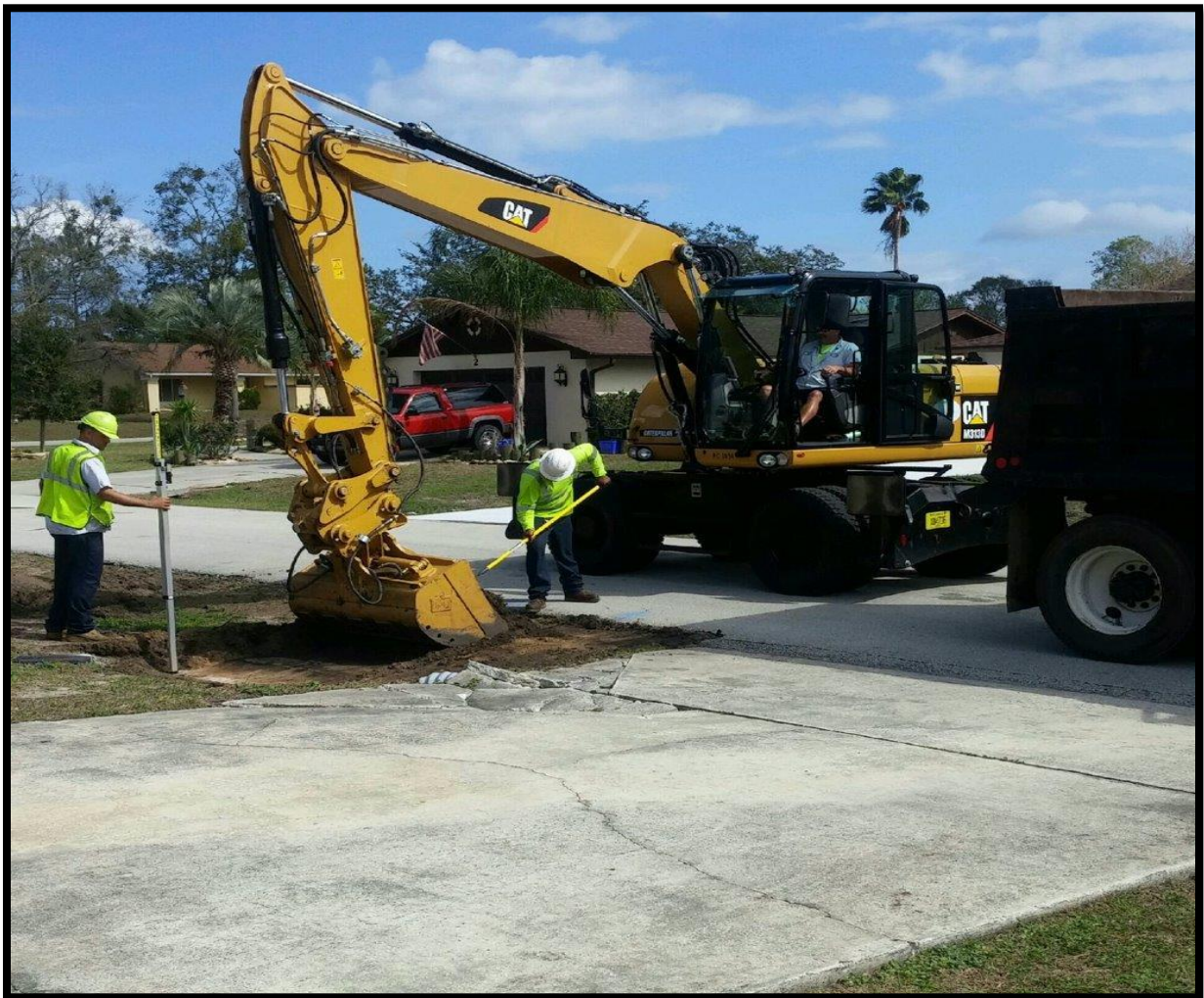
Faith Lane Swale Rehab