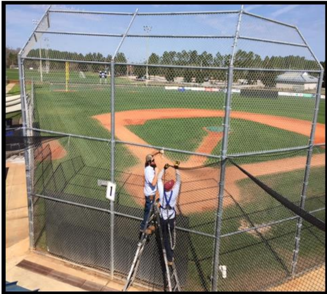
Installing Safety Nets at ITSC

Activities for the Week of February 10, 2017