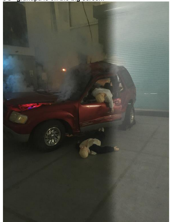
Realistic scene created by Lt. Cline, Lt. Driscoll & FF Bull