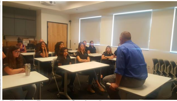
Chiefs take part in Youth Leadership Flagler – Emergency Services Day