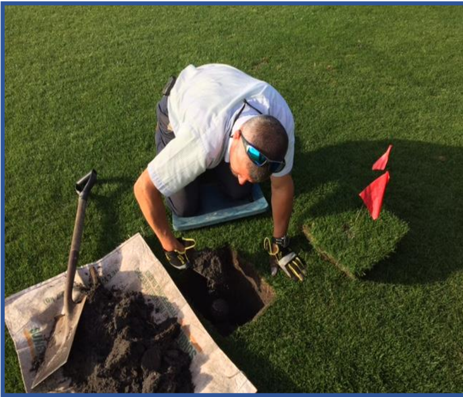
Soccer Field Irrigation Surgery – Indian Trails Sports Complex