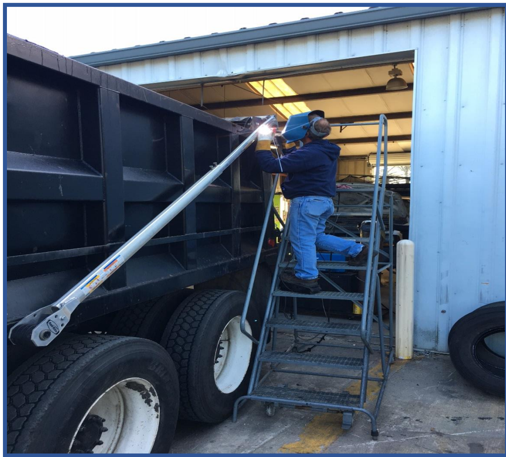
Weld Extends Life of Tarp Arm