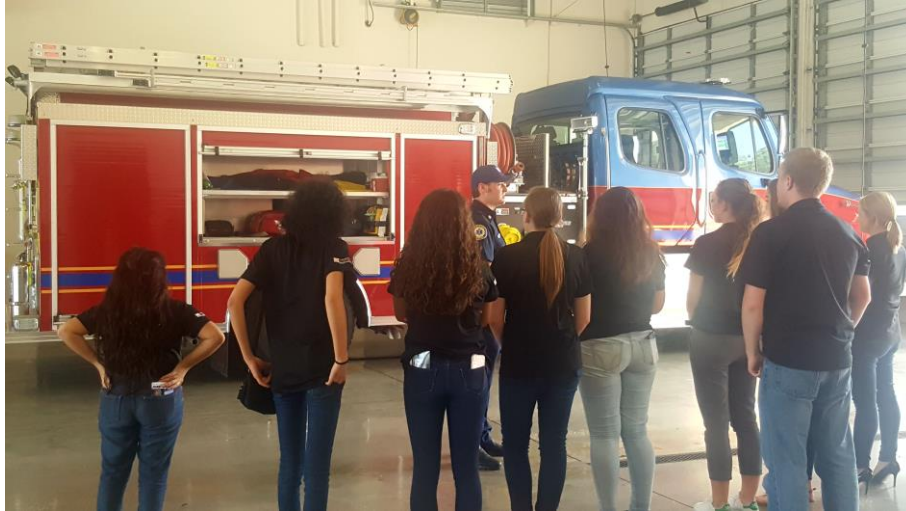
FF Hackney explains the equipment & tools used on the fire apparatus