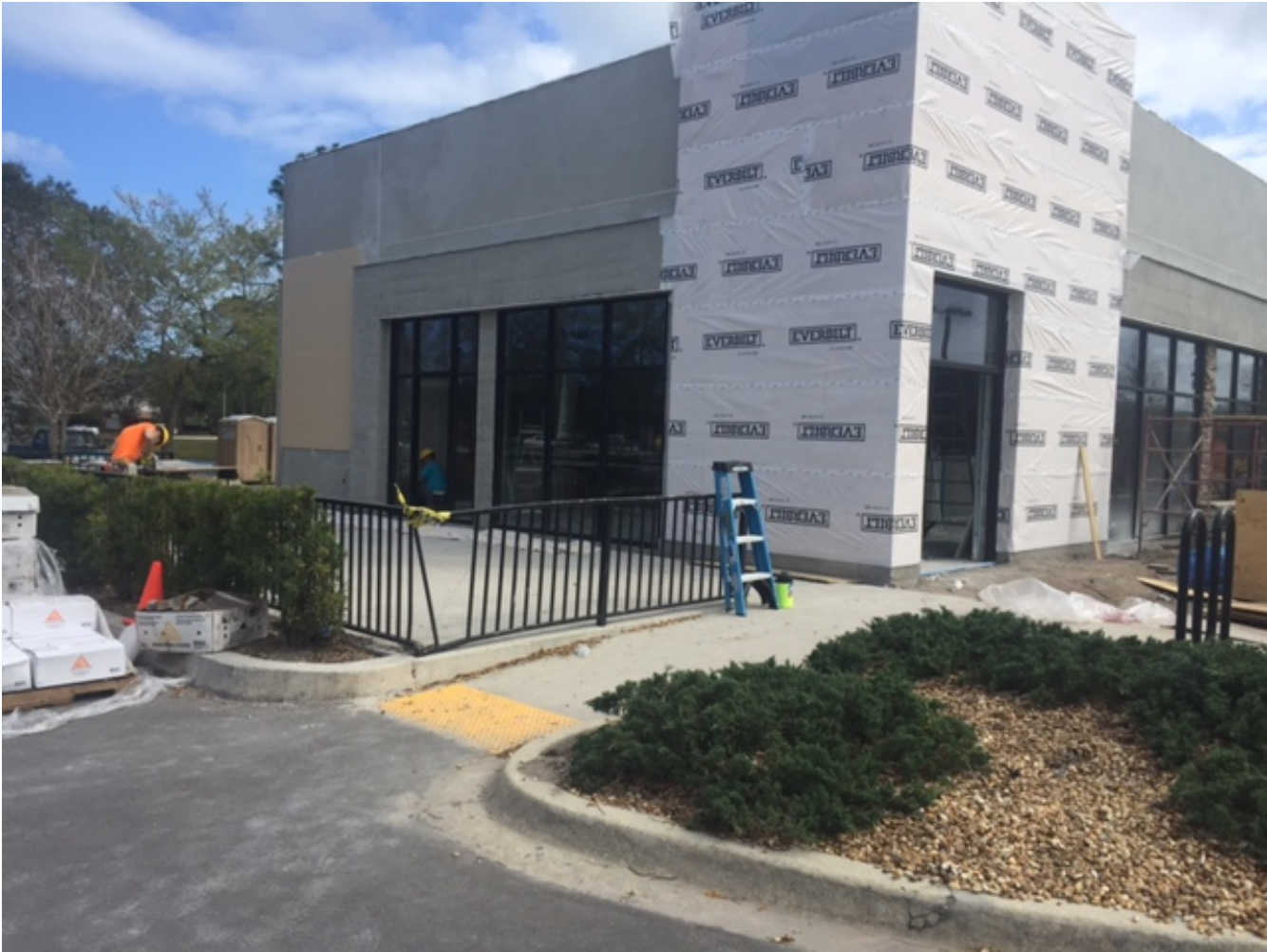
Dunkin Donuts Front Facing Palm Coast Pkwy.