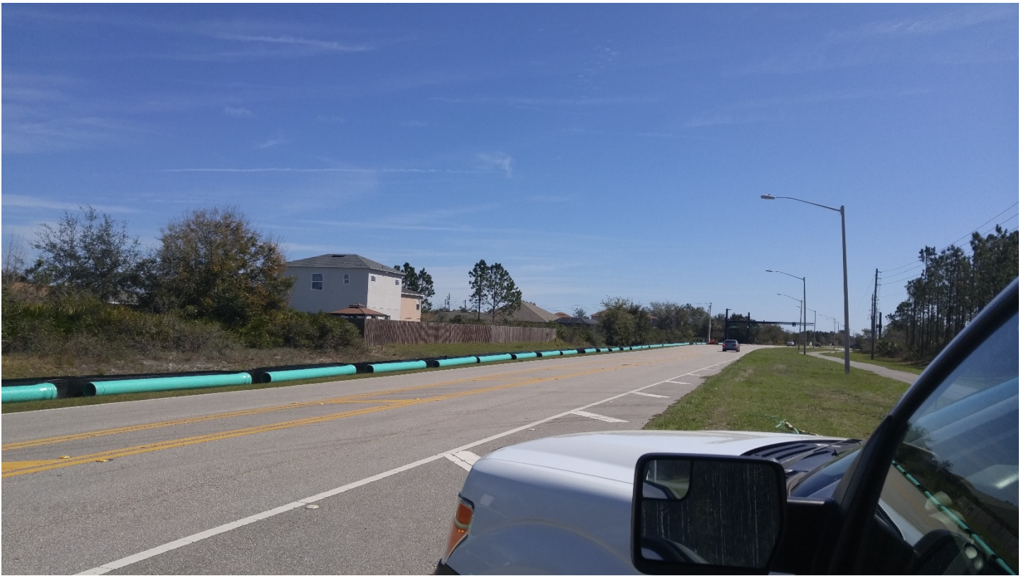
Matanzas 16" Force Main Pipe Strung Out for Installation