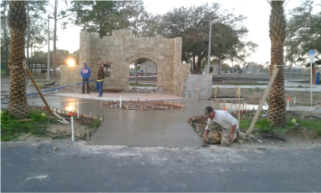
Holland Park - Finished Stamp Concrete North Portal