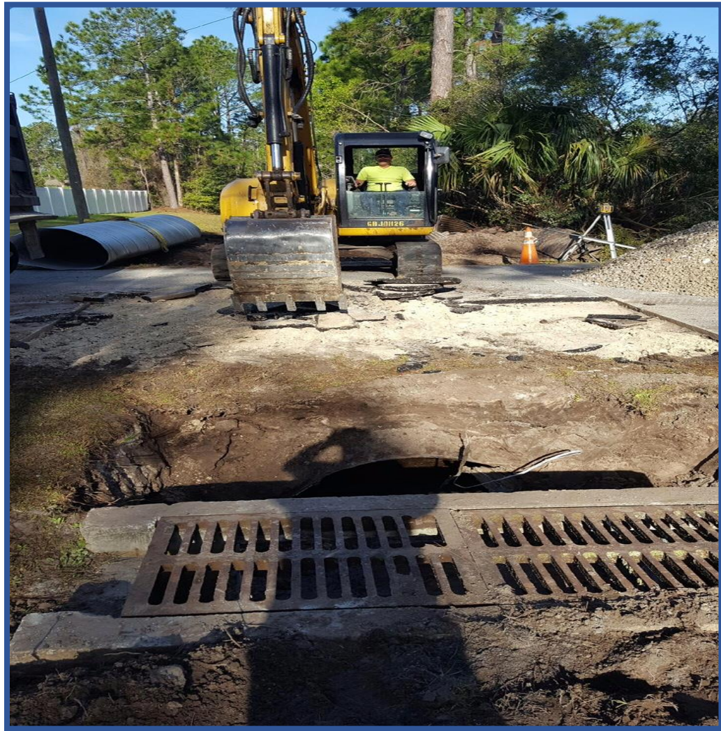
Pipe Replacement - Universal Trail