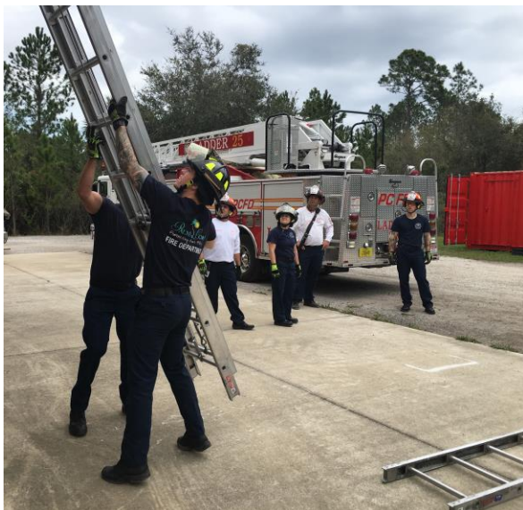
Ladder Deployment Training