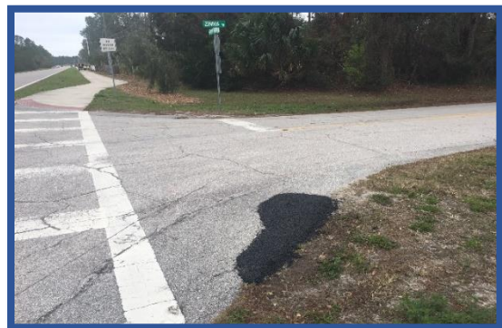
Roadway Radius Repair - Belle Terre Blvd & Zinnia Trail