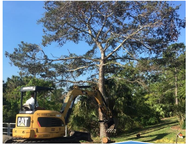
Hazardous Tree Removal Westbury Lane