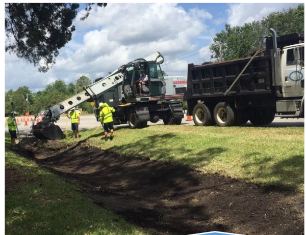
Swale Grading Old Kings Road