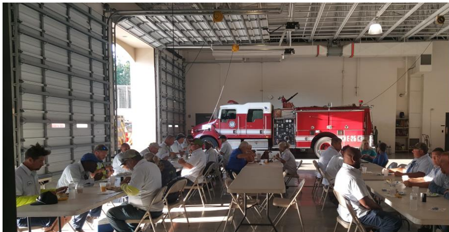
Employee Breakfast at Station 25

Physical agility testing was held this week for the new applicants. We have had a couple of Station Tours this week, as well as the Employee Breakfast and Employee Academy.