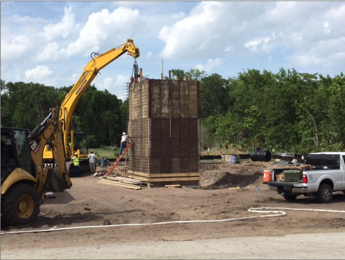
Matanzas Master Pump Station - Above Ground Structure Formation