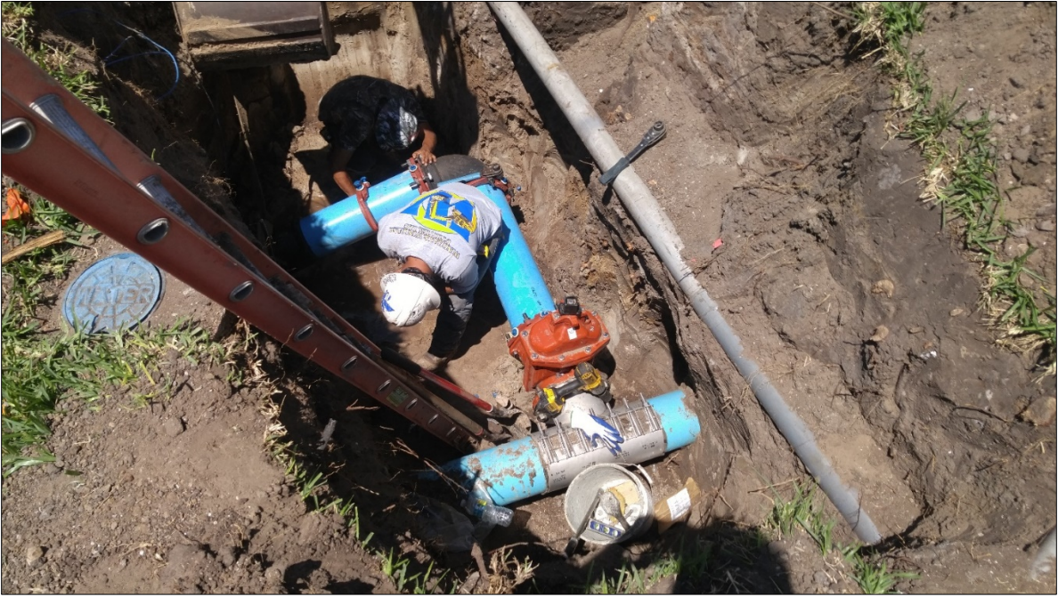
Community Center - Water Wet Tap Installation