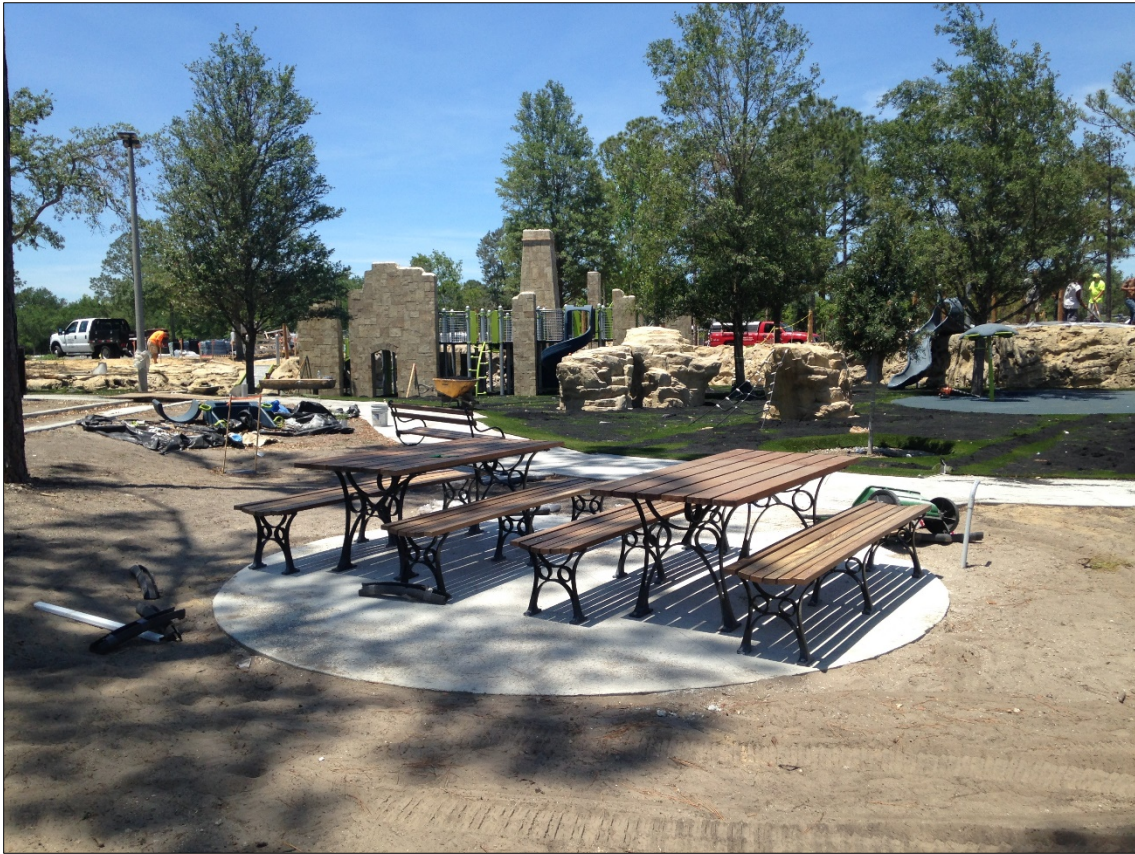
Holland Park – Benches