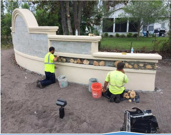
Gateway Sign Seminole Woods & US1