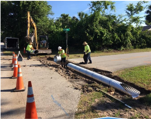
Valley Gutter Clear Court