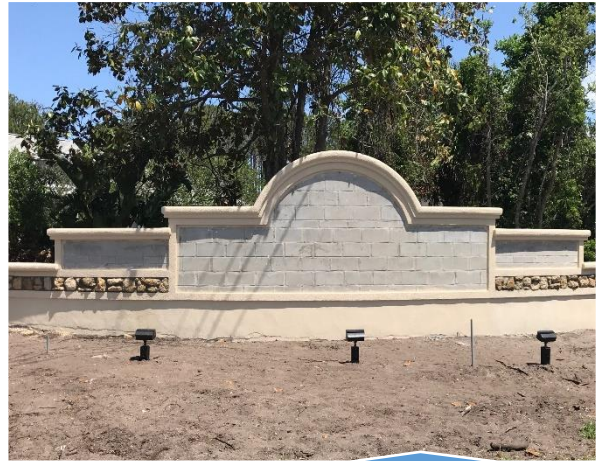
Gateway Sign Seminole Woods & US1