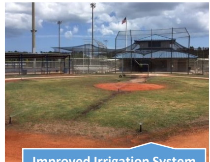
Improved Irrigation System Baseball Fields ITSC