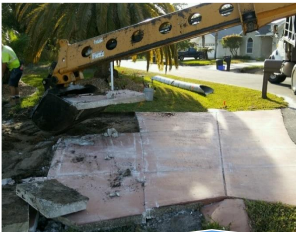
Driveway Removal Carollo Court