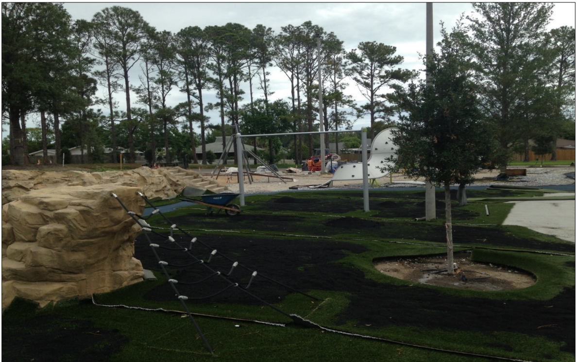
Holland Park - Artificial Grass