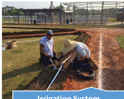
Irrigation System Improvements ITSC