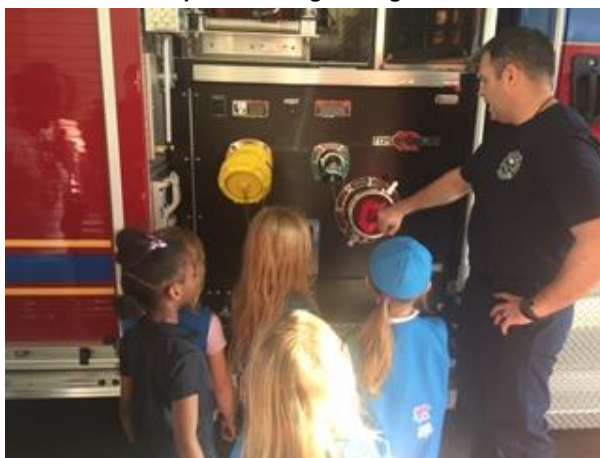
Daisy Troop Station Tour