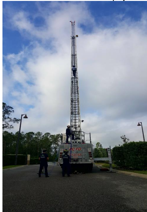
Physical Agility Testing