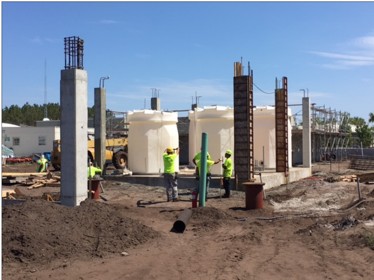
Wastewater Treatment Plant #2 - Chemical Building