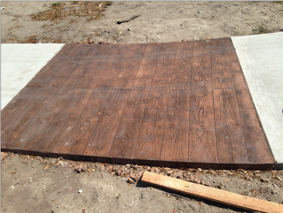
Holland Park – Faux Wood Sidewalk