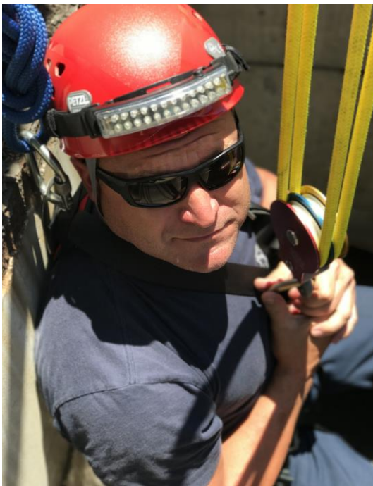
Confined Space Training / Going in the Manhole