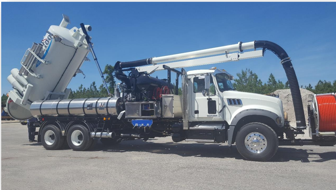
Vacuum Truck Ready For Use