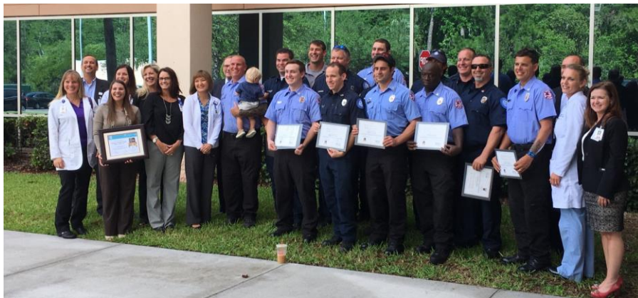
Stroke Alert Awards