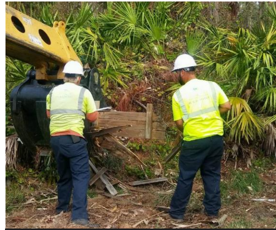
Hurricane Debris Cleanup Public Works in Palm Coast's P-Section