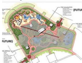
Palm Coast Community Center