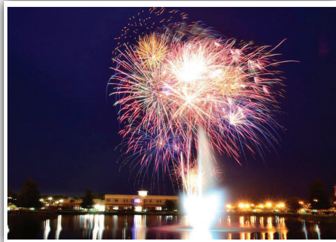
First Place Special Events: Corinne Chapman

Congratulations to the following winners: