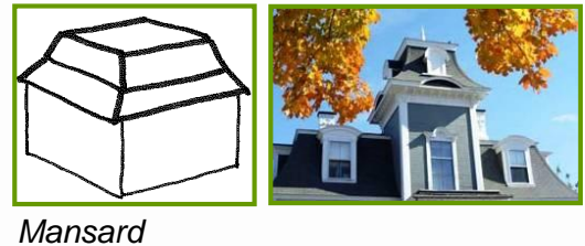
Figure 13: Comparative Examples

Pitched roofs shall have a minimum slope of 5:12 and shall have a minimum overhang of two (2) feet beyond the building wall.