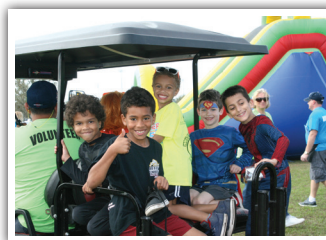
"Catching a Ride"