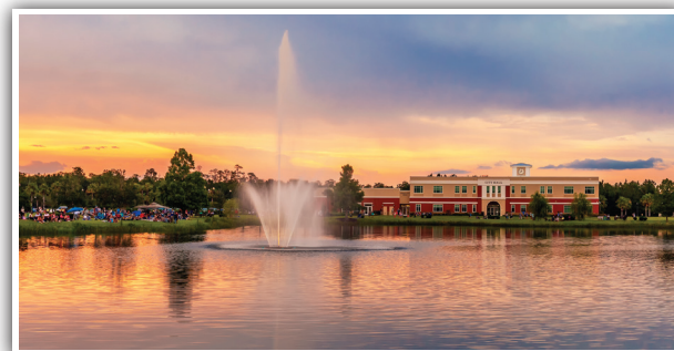
First Place: Vicki Payne "Town Center Celebration"

Congratulations to the following winners: