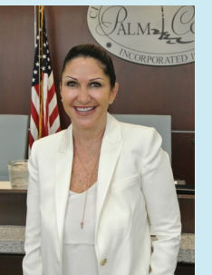
Message from the Mayor

As Palm Coasters, we rise together, we fall together and we pick ourselves back up together. So let's beat coronavirus together. Wash your hands often. Stay home when possible. Wear masks. Avoid crowds. This isn't always easy, but it's always necessary.